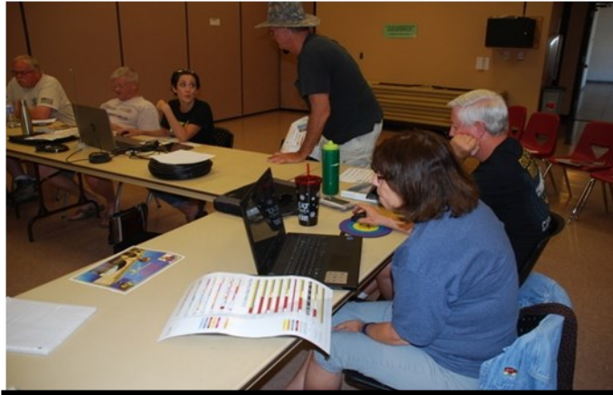
The group busy preparing for their exam on Saturday