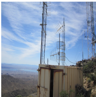
A view of the repeater housing with a look down into Lake Havasu City.