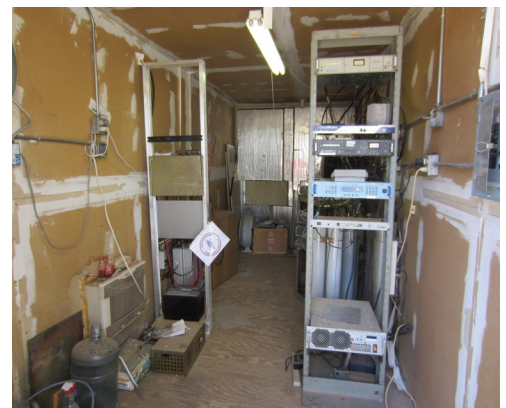
Here's a look at the transmitter setup on the left.