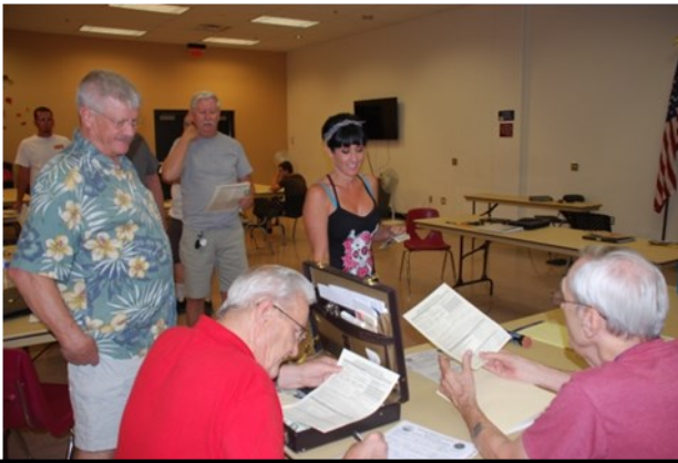
The smiles on their faces tell you that they passed.