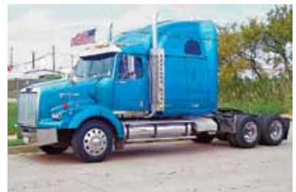
2004 Western Star 4900SA, 82 in Stratosphere; Detroit Engine 500 hp; 13 Spd OD; Engine Brake; Air Ride; 3.58 Ratio; 24.5LP Tires; All Aluminum Wheels; 244 in Wheelbase; Tandem Axle, 701,000 mi; (4PM87244-WFF-2).