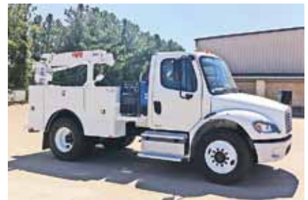
2012 Freightliner M2 106 Cab Chassis Cummins ISB, 300 HP, Allison Automatic, 5.29 Ratio, 252" Wheelbase, 22.5 Tires, Steel Wheels, De-Rated Frame and Brakes. Has Ledwell Service Body Installed. New (CDBD8962-TYL-3)