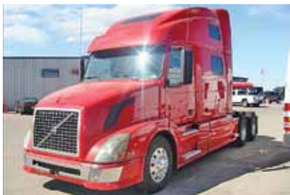
2006 Volvo 6NL64T780, 71" Double Deck Condo; VED13 Volvo Eng 465 hp; Ultrashift OD; Eng Brake; Air Ride; 3.42 Ratio; 22.5 Tires; All Alum. Wheels; 12,500# Frnt Axle Wt; 40,000# Rear Axle Wt, 510,935 Miles. (6N416136-ABQ-3) $41,900 $34,900