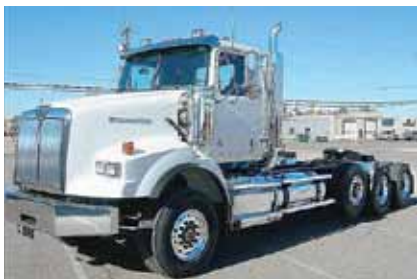
2012 Western Star 4900SA, Cummins Engine 525 hp; Diesel; 18 Spd; Engine Brake; Air Ride; 4.30 Ratio; 24.5 Tires; All Aluminum Wheels; 260" WB; Tri Axle; 20,000 lb Front Axle Wt; 46,000 lb Rear Axle Wt. New (CPBM9529-FAR-2)