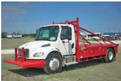
2005 Freightliner M2 106 Bobtail, Caterpillar C7, 210 HP, 6 SPD, Air Ride Suspension, 4.11 Ratio, 270" Wheelbase, Steel Wheels, 22.5 Tires, Under CDL, Air Brakes, 129,000 Miles. (5DV05967-SAN-3)