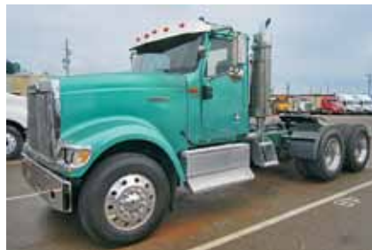
2000 International 9900, Caterpillar C12, 430 HP, 10 Spd Transmission Air Ride Suspension, 24.5 Tires, Aluminum Front Wheels, Aluminum Outer Rear Wheels. (YCO66784-TYL-2) $23,500