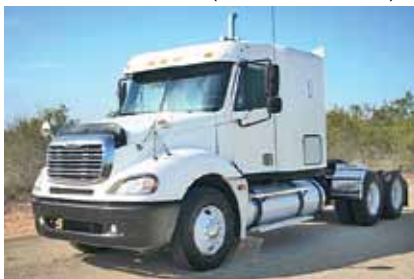
2006 Freightliner Conventional, 58 inch Sleeper, Detroit Diesel DDC 14.0, 455 HP, 10 SPD, 3.55 Ratio, 22.5 LP Tires, Steel Wheels, 602,000 Miles. (6LV90039-SAN-2)