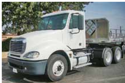
2005 Freightliner CL120 Columbia Day Cab, Detroit Diesel DDC 14.0, 450 HP, 10 Spd, Air Ride Suspension, 3.70 Ratio, 171" Wheelbase, 22.5 Tires, Steel Wheels, 489,506 Miles. (5LN93610-ABL-3)