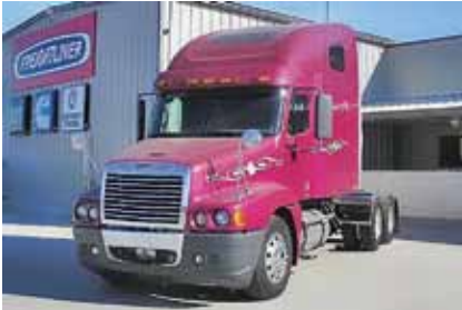
2007 Freightliner Century 120, 70 in Raised Roof Condo; 14.0 Detroit 500 hp; Diesel; 10 Spd OD; Engine Brake; Air Ride; 3.42 Ratio; 11R 24.5 Tires; Aluminum/Steel Wheels; 230 in Wheelbase; Tandem Axle. (7LY45231-TEM-2)