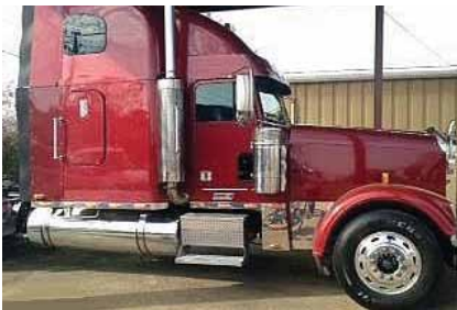
2003 Freightliner Classic XL, 70 in Condo Sleeper; C15 Caterpillar Engine 475 hp; Diesel; 10 Spd OD; Engine Brake; Air Ride; All Aluminum Wheels; 259 in Wheelbase; Tandem Axle. (3LK54748-TXK-3) $28,500