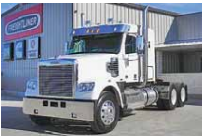
2012 Freightliner Coronado SD, 48 in Sleeper; DD 15 Detroit Engine 505 hp; Diesel; 10 Spd OD; Engine Brake; Air Ride; 3.42 Ratio; 11R 24.5 Tires; Aluminum/Steel Wheels; 230" WB; Tandem Axle. New (CDBM5408-WAC-2)