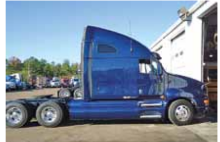
2007 Kenworth T2000, Raised Roof Sleeper, Caterpillar C15, 435 HP, 13 Spd, Air Ride Suspension, 3.36 Ratio, 22.5 LP Tires, All Aluminum Wheels. (7J168327-TXK-2) $43,500