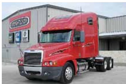
2008 Freightliner CL12064ST Century 120, 70 in RR Condo; 14.0 Detroit Engine 500 hp; Diesel; 10 Spd OD; Engine Brake; Air Ride; 3.42 Ratio; LP 22.5 Tires; All Aluminum Wheels; 230 in WB, 559,150 Miles. (8LAB3328-BRY-2) $59,750