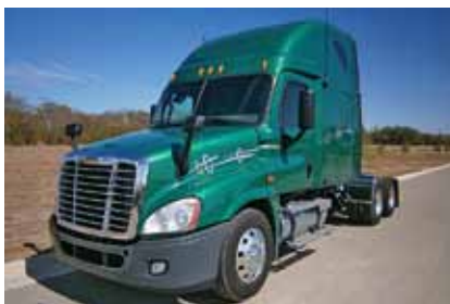
2009 Freightliner CA12564SLP Cascadia, 72 in Raised Roof Condo; 14.0 Detroit Engine 500 hp; Diesel; 10 Spd OD; Engine Brake; Air Ride Suspension; 3.42 Ratio; LP 22.5 Tires; All Aluminum Wheels; 230 in Wheelbase; Tandem Axle, Thermo King APU, 357,000 Miles. (9LAF0076-BRY-3)