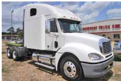
2007 Freightliner Columbia CL120, Detroit Diesel DDC 14, 455 HP, 10 Spd, 70" Condo Sleeper, Air Ride Suspension, 3.58 Ratio, 230" WB, 22.5 LP Tires, All Aluminum Wheels, 498,210 Miles. (7LY88971-SHV-2) $42,500 $33,500