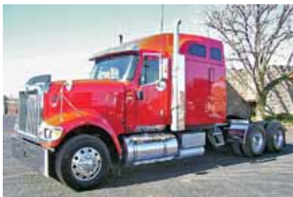
2008 International 9900 Mid Roof Sleeper, Caterpillar C15, 475 HP, 13 Spd, 3.58 Ratio, Engine Brake, Air Ride Suspension, 22.5 LP Tires, All Aluminum Wheels, 509,000 Miles. (8C637335-ABL-2)