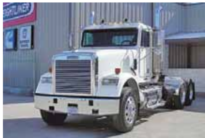
2006 Freightliner FLD12064SD, 14.0 Detroit Engine; Diesel; 10 Spd OD; Engine Brake; Air Ride Suspension; 3.58 Ratio; 11R 24.5 Tires; Aluminum Wheels; 220 in Wheelbase; Tandem Axle, 288,000 Miles. (6DX05832-WAC-3)