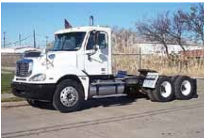
2005 Freightliner Columbia 120, Diesel Mercedes Engine 410 hp; 10 Spd OD; Engine Brake; Air Ride Suspension; 3.55 Ratio; 24.5LP Tires; Aluminum/Steel Wheels; 202 in Wheelbase; Tandem Axle, 411,000 Miles. (5DN64685-WFF-3)