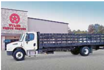
2004 Freightliner Business Class M2 Medium Duty, Diesel Fuel Type; 6 Spd OD; 4.11 Ratio; Steel Disc Wheels; LOW LOW Miles and Clean Fleet Maintained, Gross Vehicle Weight (lbs): 26000, 120,000 Miles. (4HM63358-SHV-3) $26,500

See a complete inventory of new and used trucks and trailers online at: www.LonestarTruckGroup.com