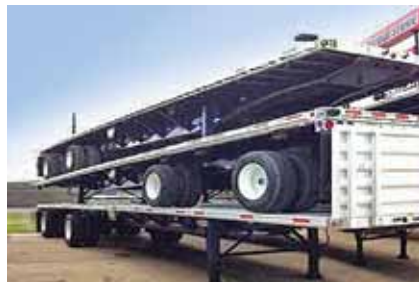
2003 Fontaine Combo Flatbed, (Qty: 10) Air Ride; 48 ft Length x 102 in Width; Aluminum Floor; 22.5 Tires; All Steel Wheels; Spread Tandem Axle; Combination Composition. (31516798-SHV-TRL-3b)