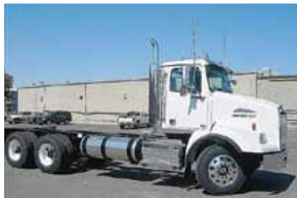
2012 Western Star 4900, (Qty: 2) Standard Cab; DD13 Detroit Engine 450 hp; Diesel; 8LL; Engine Brake; TufTrac; 4.30 Ratio; 24.5 Tires; Aluminum/Steel Wheels; 227 in Wheelbase; Tandem Axle, New (CPBM2894-FAR-3)