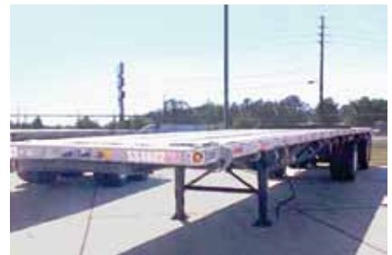
2000 Utility Flat Bed, 48' x 102", 2..5 LP Tires, Air Ride Suspension, Aluminum Floor, Sliding Winches. (YA317116-TYL-TRL-3c)