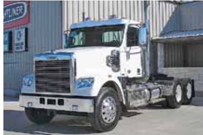
2012 Freightliner CC12264 Coronado, DD 15 Detroit Engine 475 hp; Diesel; 10 Spd OD; Engine Brake; Air Ride Suspension; 3.58 Ratio; 11 R 24.5 Tires; Aluminum/Steel Wheels; 220 in Wheelbase; Tandem Axle. New (CDBM5400-TEM-3)