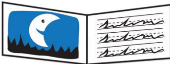
Landscape primary lined

PLUS: More kit options are available at: studenttreasures.com/sc