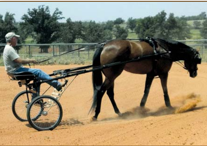
Two more examples of the beauty and athleticism that Etched In The Stars is siring!