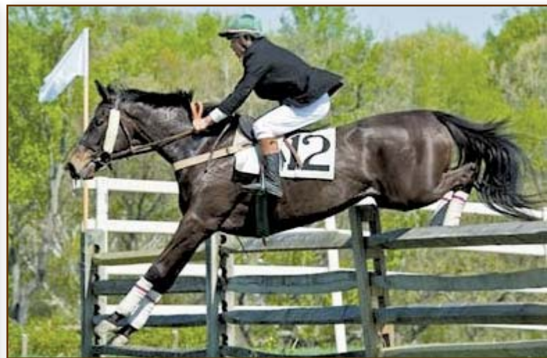
This is just an example of the broodmares that Deb is breeding to Etched In The Stars. Deb invites you to come to her ranch when you are in the market for an outstanding young prospect.