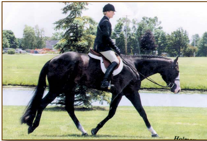
The beautiful extended trot that "Regis" has displayed to win his many awards in his English classes.