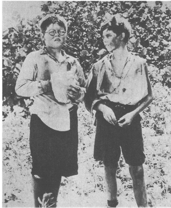
From the film Lord of the Flies, 1963.

The scene shifts to Ralph, alone, hiding from the rest of the boys who are hunting him. The language used to describe the boys has shifted: they are now "savages," and "the tribe." Ralph is utterly alone, trying to plan his own survival. He finds the Lord of the Flies, and hits the skull off the stick.