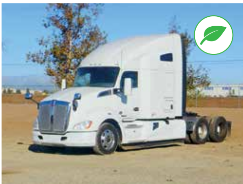
2019 Kenworth T680 – CARB Compliant