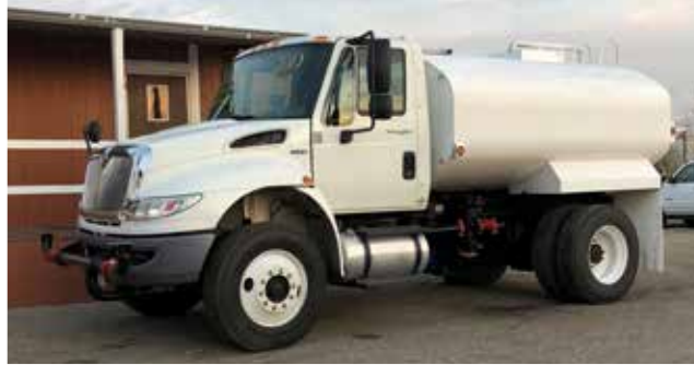
2012 International 4400 – CARB Compliant