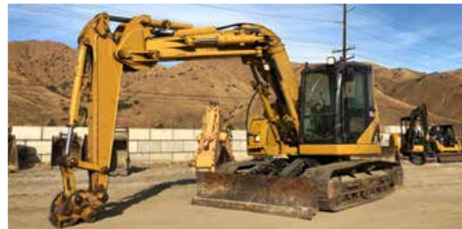
1 of 2 – Caterpillar 314CLCR – Tier 2