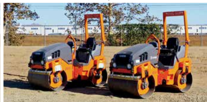
2 of 6 – Unused – 2019 Hamm HD12VV – Tier 4 Final