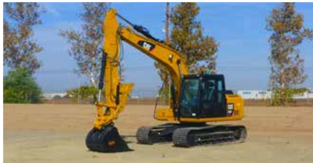
1 of 2 – 2018 Caterpillar 313FLGC – Tier 4 Final