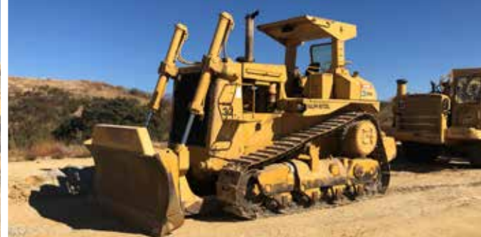
1 of 7 – Caterpillar D9L