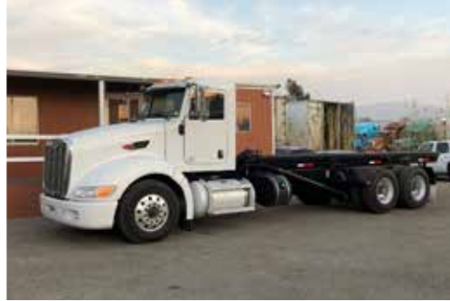
2012 Peterbilt 386 – CARB Compliant