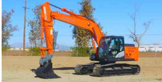
2018 Hitachi ZX180-LC5 – Tier 4