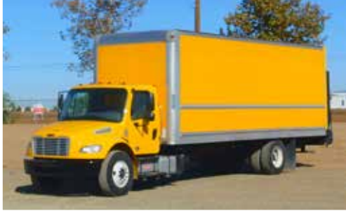
2014 Freightliner M2 Business Class CARB Compliant