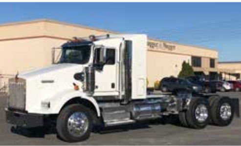
2014 Kenworth T800 - Low Mileage CARB Compliant