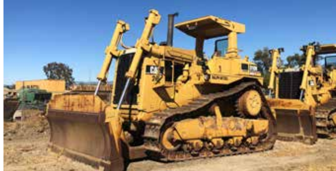
1 of 4 – Caterpillar D10N