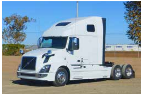
2019 Volvo VNL670 - CARB Compliant