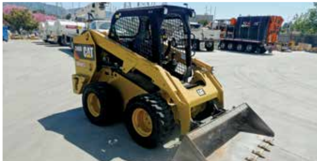
2016 Caterpillar 246D – Tier 4