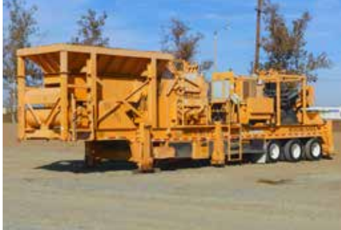
CEC Road Runner 115 in. x 102 ft Jaw Crusher