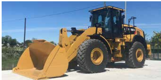
Unused – 2018 Caterpillar 950M – Tier 4 Final