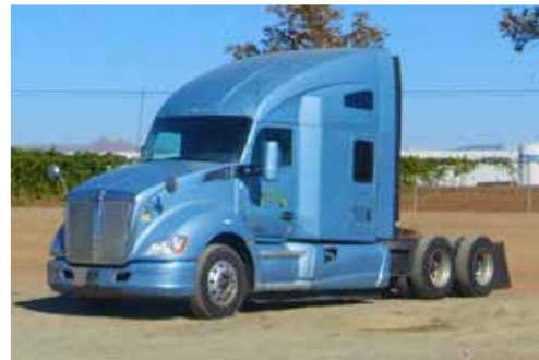
1 of 5 - 2016 Kenworth T680 - CARB Compliant