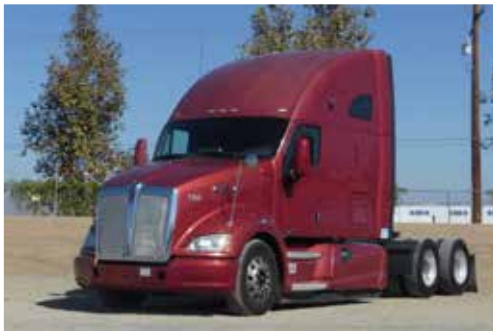
2013 Kenworth T700 - CARB Compliant