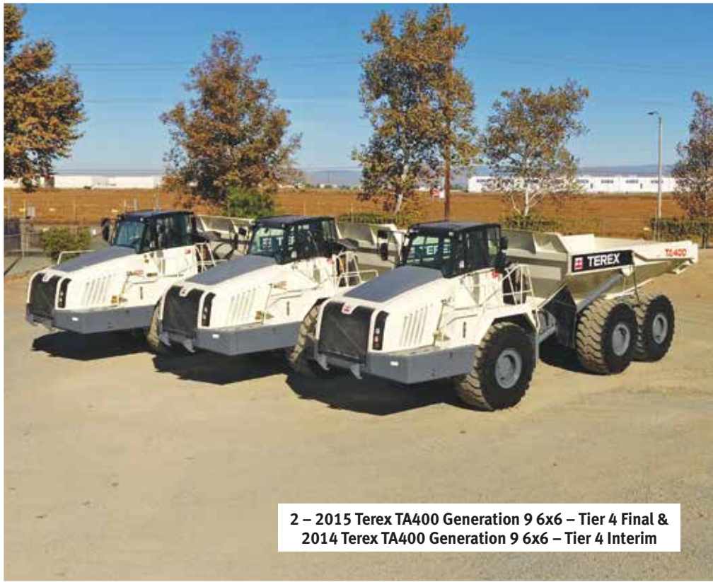
2 – 2015 Terex TA400 Generation 9 6x6 – Tier 4 Final & 2014 Terex TA400 Generation 9 6x6 – Tier 4 Interim