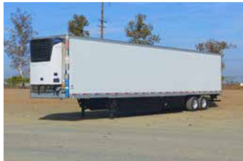
2019 Utility VS2RA 53 Ft