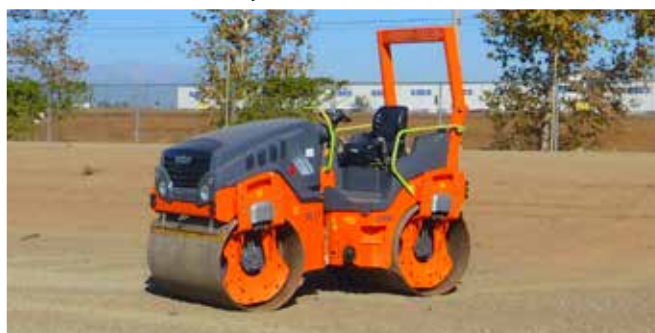
2015 Hamm HD13VV – Low Meter Hours – Tier 4