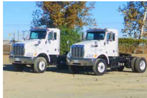
2 of 5 - 2015 Peterbilt 382 - CARB Compliant