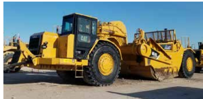
2017 Caterpillar 657G – Tier 4 Flex