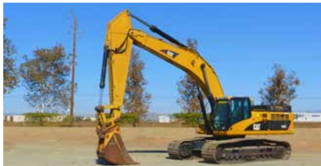
1 of 2 – Caterpillar 345CL – Tier 3