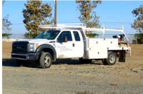
1 of 3 – 2015 Ford F450 XL