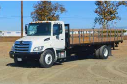
2015 Hino 268 – CARB Compliant