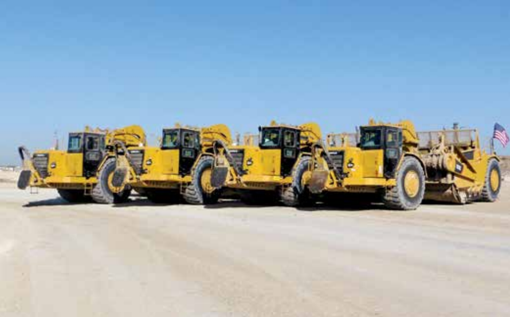
3 – 2016 & 2017 Caterpillar 657G – Tier 4 Flex