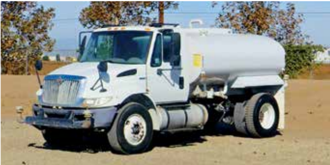
1 of 2 – 2010 International 4300