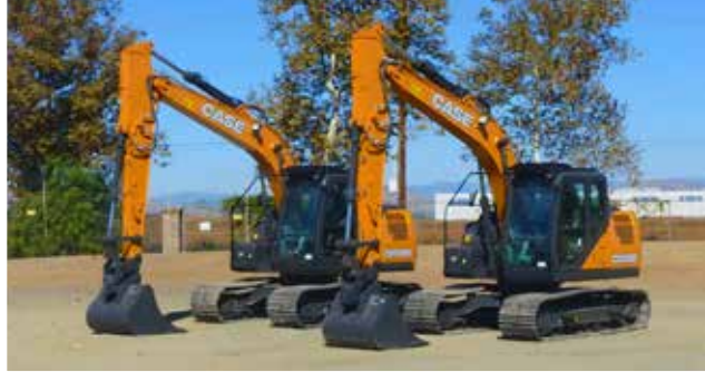
2 – Unused – 2019 Case CX130DLC – Tier 4 Final

Call our consignment specialists at 602.442.3380 or visit LeakeCar.com