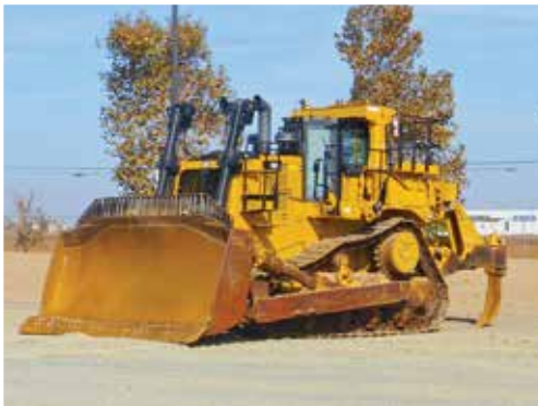
2016 Caterpillar D10T2 – Tier 4 Final