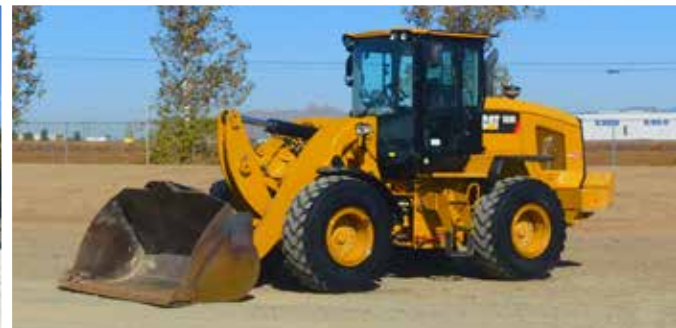
2012 Caterpillar 938K – Tier 4 Interim