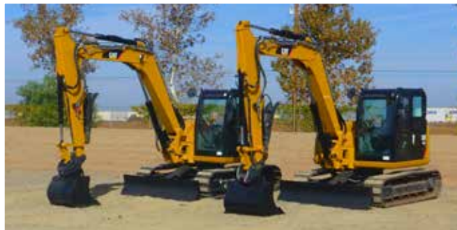
2 of 4 – 2017 Caterpillar 308E3CR – Tier 4 Final