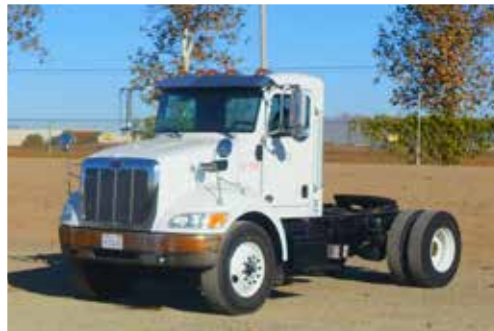
2016 Peterbilt 337 - CARB Compliant