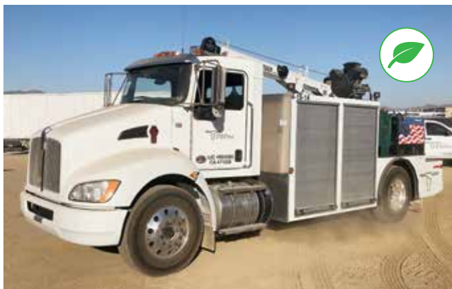
2019 Kenworth T370 – CARB Compliant