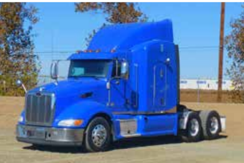
2014 Peterbilt 386 - CARB Compliant