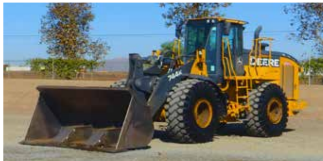
2013 John Deere 744K – Tier 4 Interim