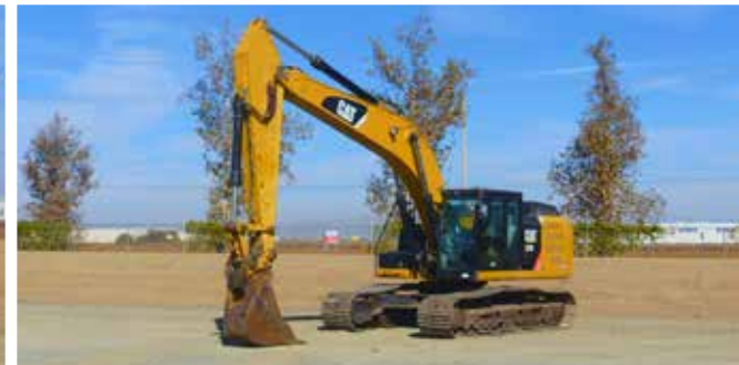
2011 Caterpillar 329EL – Tier 4 Interim