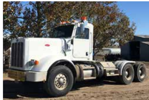
2014 Peterbilt 367 - CARB Compliant