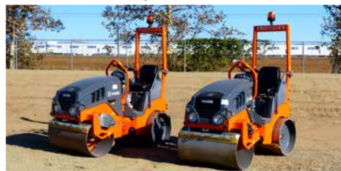
2 – Unused – 2019 Hamm HD10CVV – Tier 4 Final