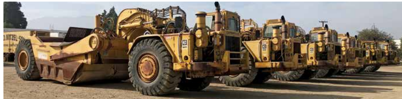
6 of 24 – Caterpillar 651B