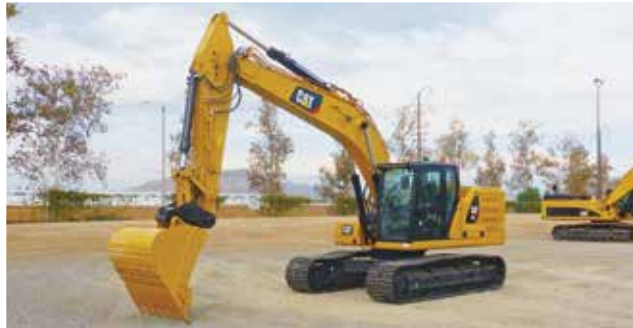
1 of 3 – 2018 Caterpillar 320FL – Tier 4 Final