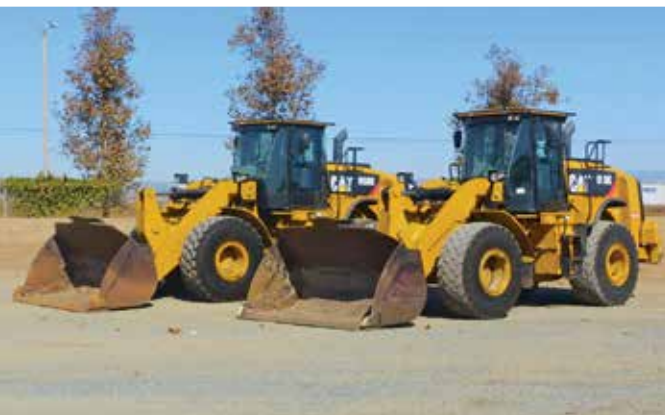
2 – 2012 Caterpillar 950K – Tier 4