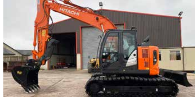
2018 Hitachi ZX135US-6 – Tier 4 Final