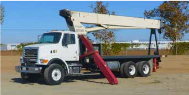
Sterling LT7500 w/Terex BT5092 25 Ton