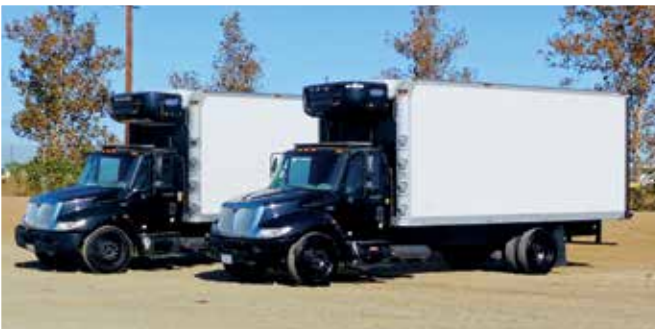
2 of 6 – 2014 International 4300LP – CARB Compliant