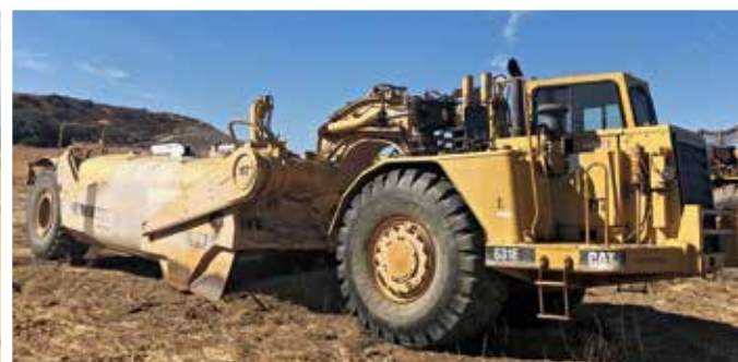
1 of 3 – Caterpillar 631E