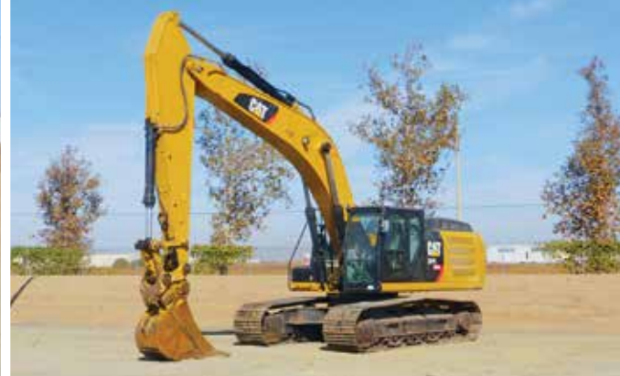
2011 Caterpillar 336EL – Tier 4