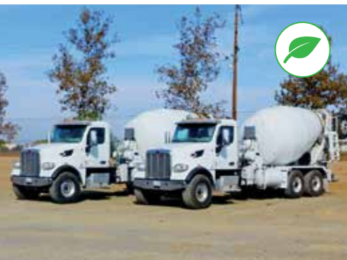
2 – 2019 Peterbilt 567 – CARB Compliant