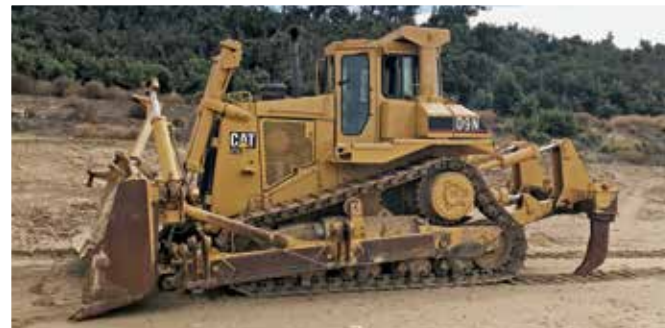
Caterpillar D9N – Tier 3 Repower