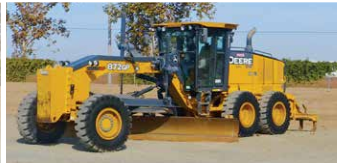
2011 John Deere 872GP – Tier 4 Interim