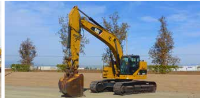
Caterpillar 328DL CR – Tier 3