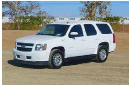
2011 Chevrolet Tahoe Hybrid