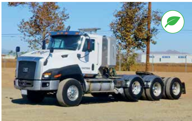
2013 Caterpillar CT660L – CARB Compliant