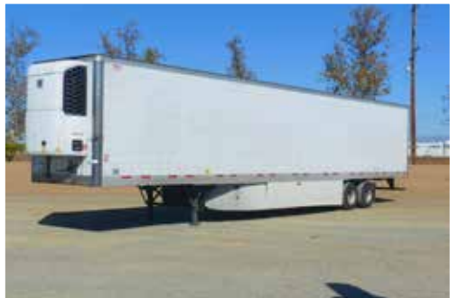
1 of 7 – 2013 Wabash RFALHSA 53 Ft