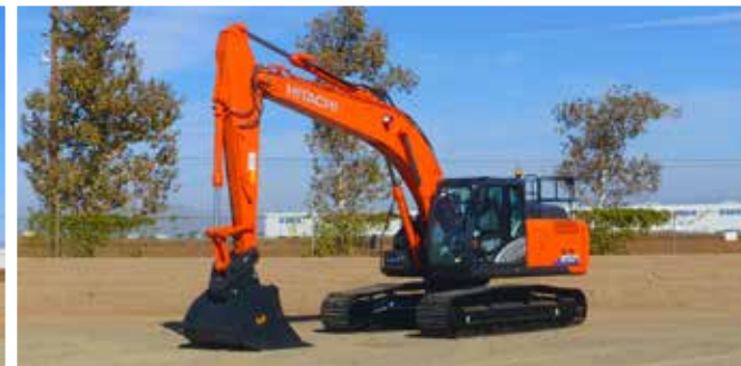
2019 Hitachi ZX210LC-6 – Tier 4 Final