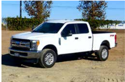
2017 Ford F250 STX 4x4