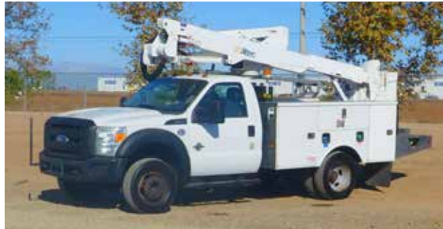
2011 Ford F550 w/Altec AT37G