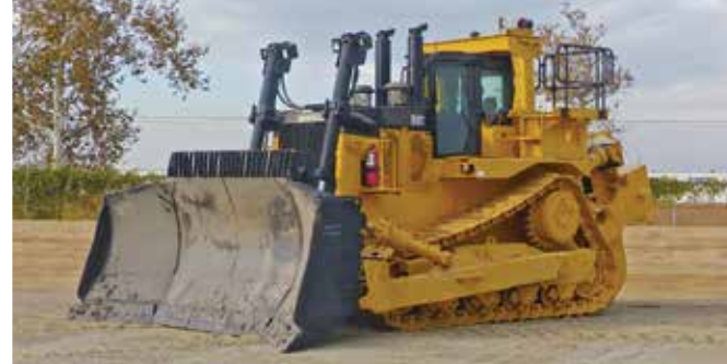
2011 Caterpillar D10T – Tier 3 Flex