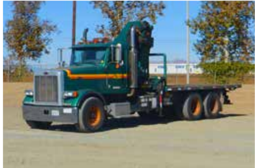
Peterbilt 378 w/Palfinger PK36002