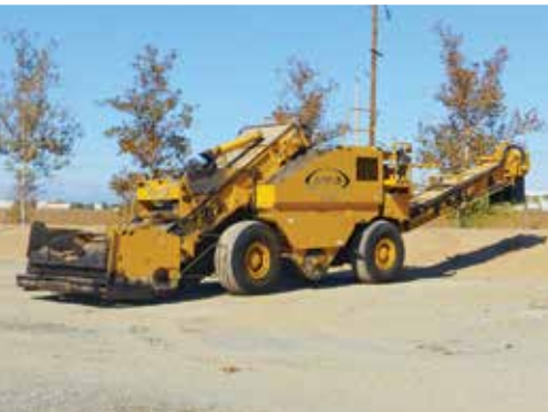
2014 Weiler E2850 – Tier 3