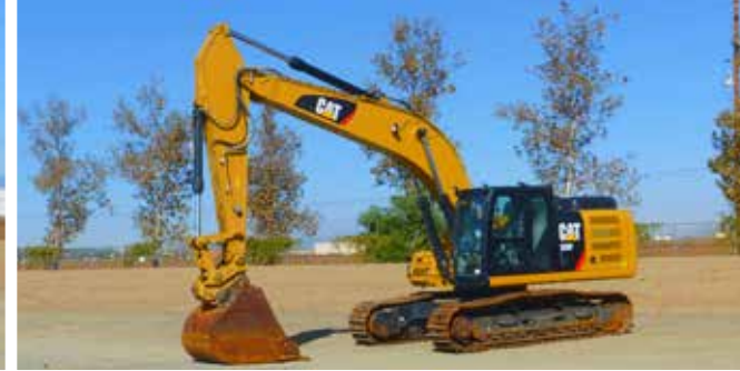
2018 Caterpillar 330FL – Tier 4 Final