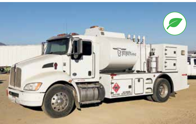
2016 Kenworth T370 – CARB Compliant