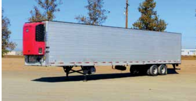
Utility VS2RA 53 Ft