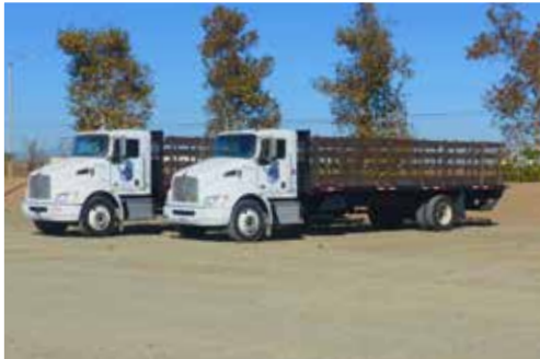
2 of 4 – 2011 Kenworth T270 – CARB Compliant