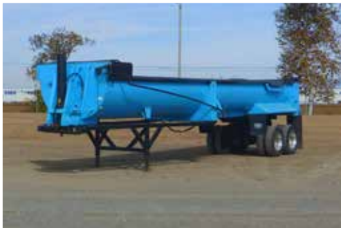
Western Construction 36 Ft