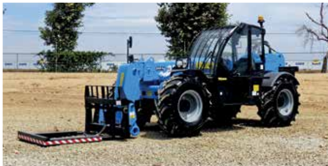
Unused – 2019 Genie GTH3700 4x4x4 – Tier 4 Final