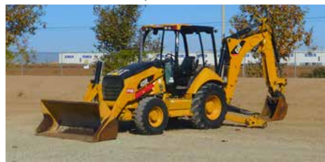
2010 Caterpillar 420E 4x4 – Tier 3