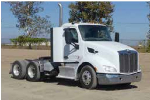
2014 Peterbilt 579 - CARB Compliant