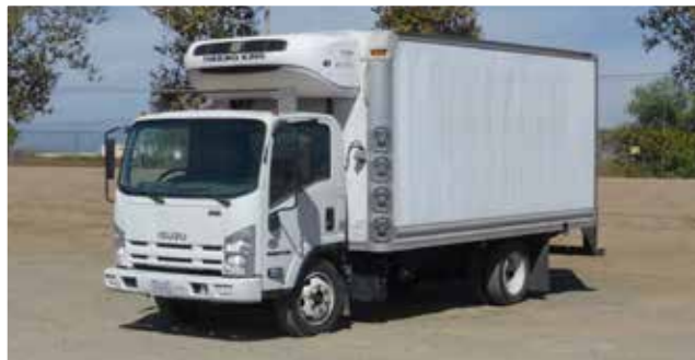
1 of 3 – 2013 Isuzu NQR – CARB Compliant