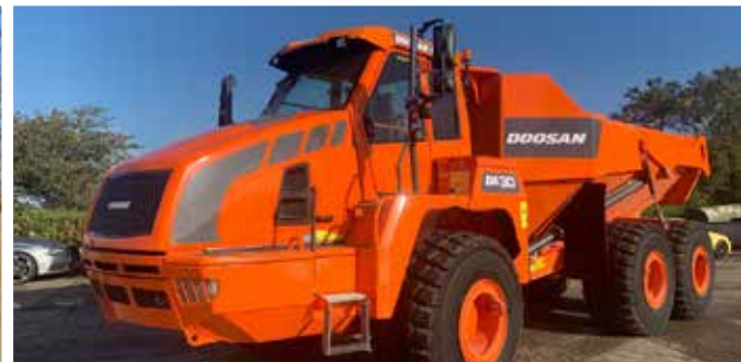
1 of 2 – 2016 Doosan DA30 – Tier 4