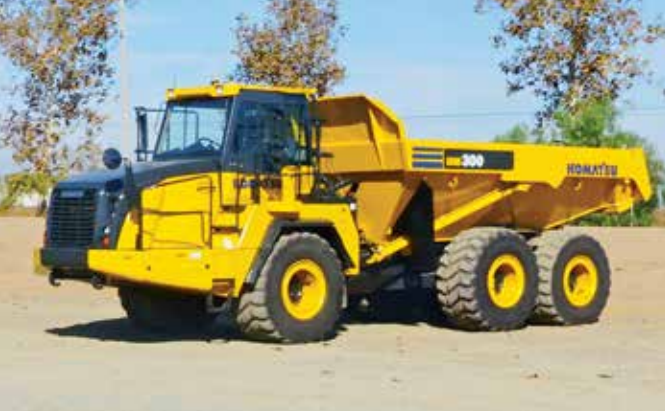
2014 Komatsu HM300-3 6x6 – Tier 4 Final