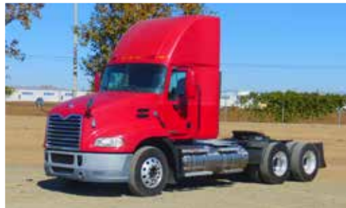
1 of 3 - 2015 Mack CXU633 - LNG Fuel CARB Compliant