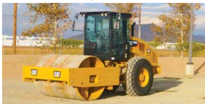
2014 Caterpillar CS66B – Tier 4 Interim