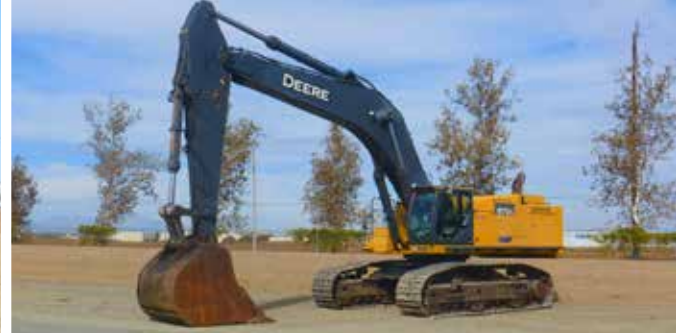
2012 John Deere 870G LC – Tier 4 Interim