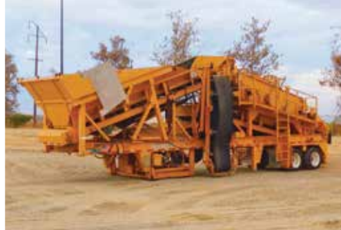
CEC Road Runner 5 x 12 ft 2 Deck Screen-It