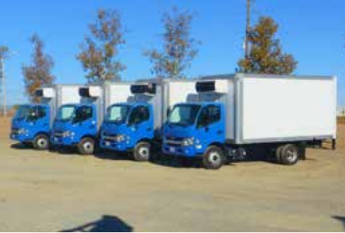
4 of 8 – 2015 Hino 195 – CARB Compliant