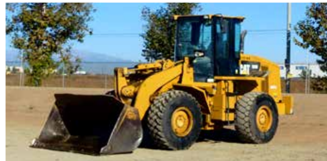
2011 Caterpillar 938H – Tier 3