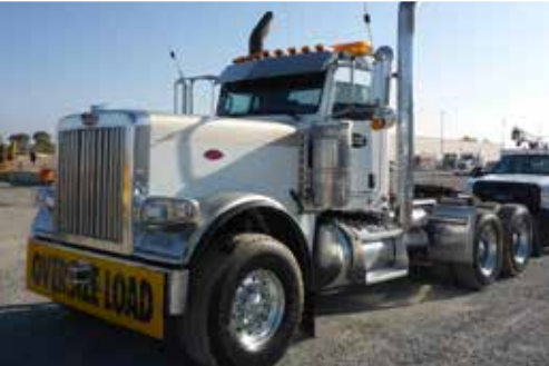
1 of 2 – 2010 Peterbilt 389