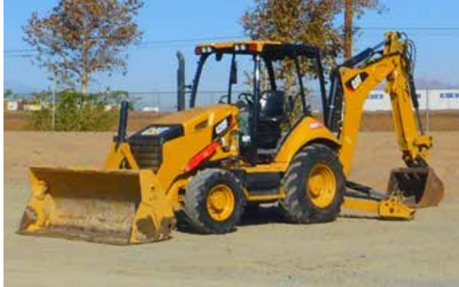
2014 Caterpillar 420F 4x4 – Tier 4 Interim