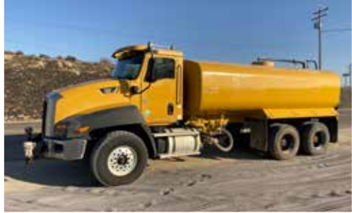
1 of 2 – 2016 Caterpillar CT660 4500 Gallon CARB Compliant