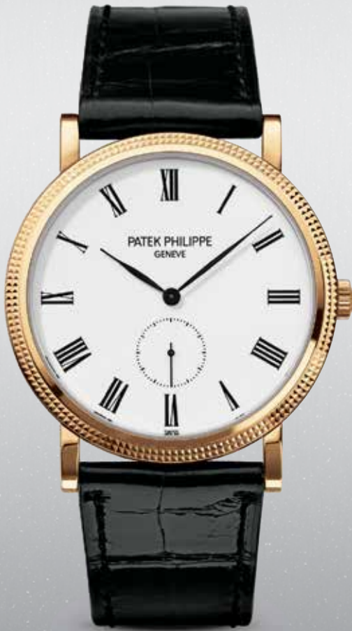
Calatrava Ref. 5119J

You never actually own a Patek Philippe. You merely take care of it for the next generation.