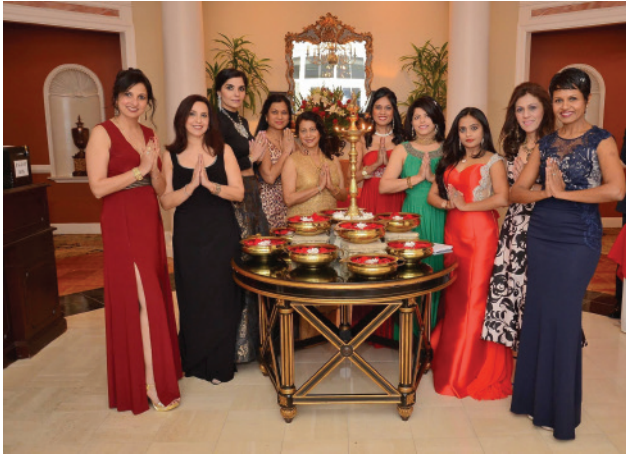
Queen City Saheli's Gala to support Turning Point