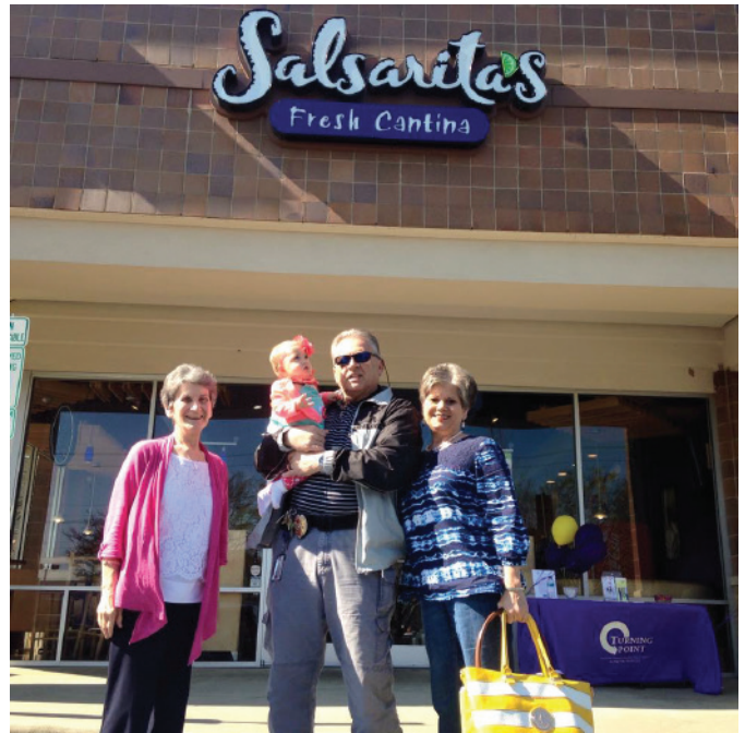
Salsarita's Fundraiser 2016