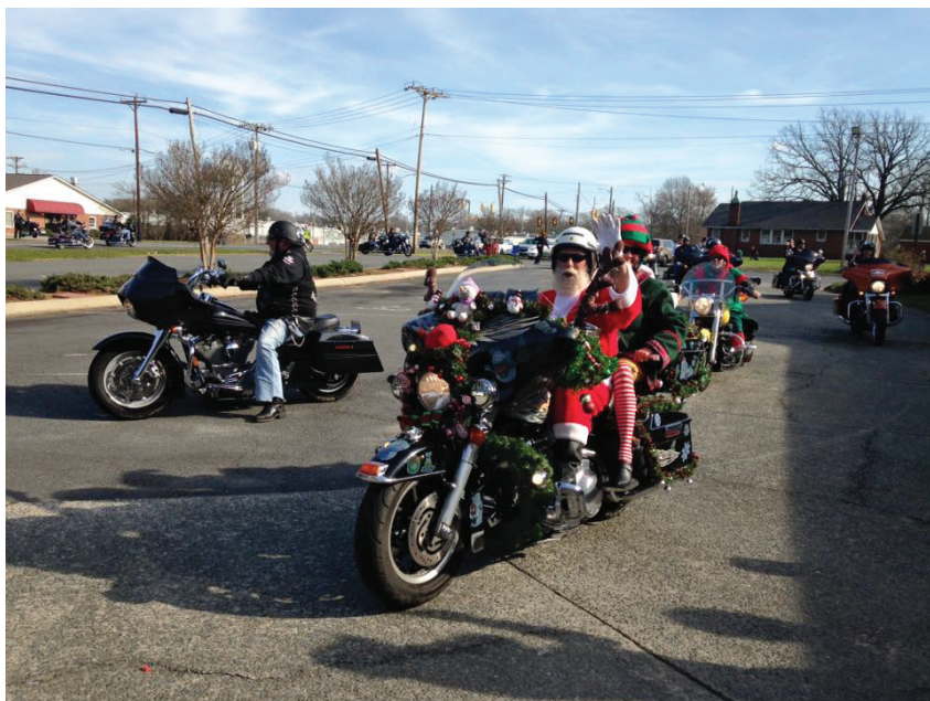
Thumper's Toy Run- 2015