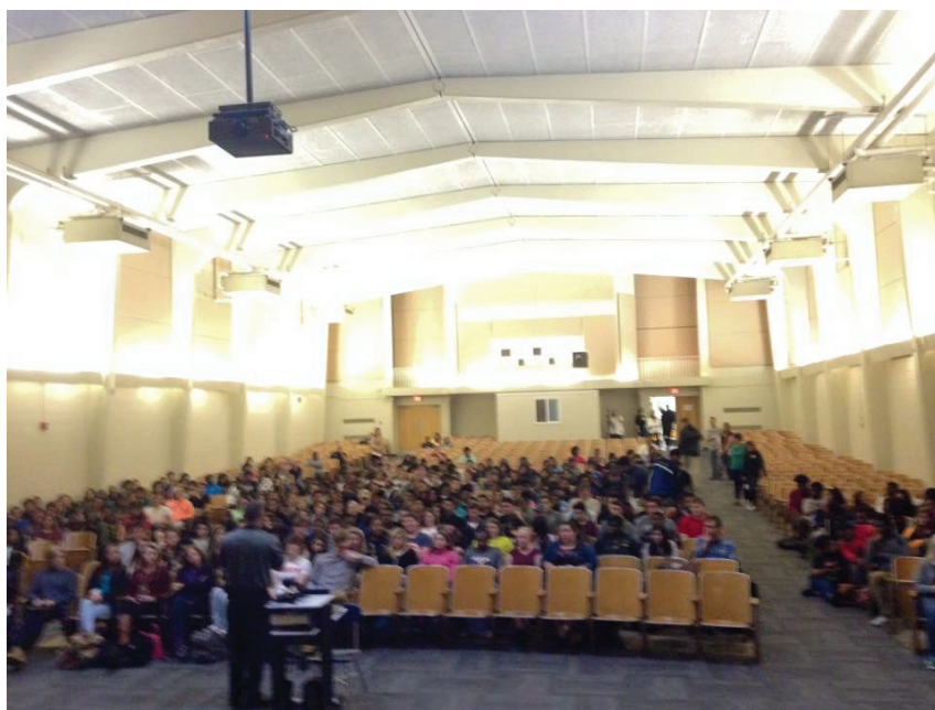
Teen Dating Abuse Prevention- Forest Hills High School