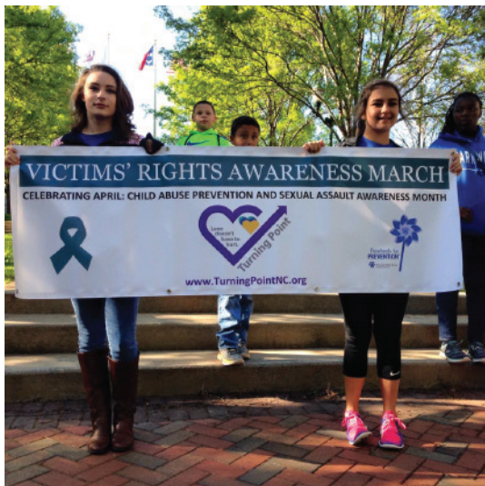
Victim's Rights Awareness March 2016