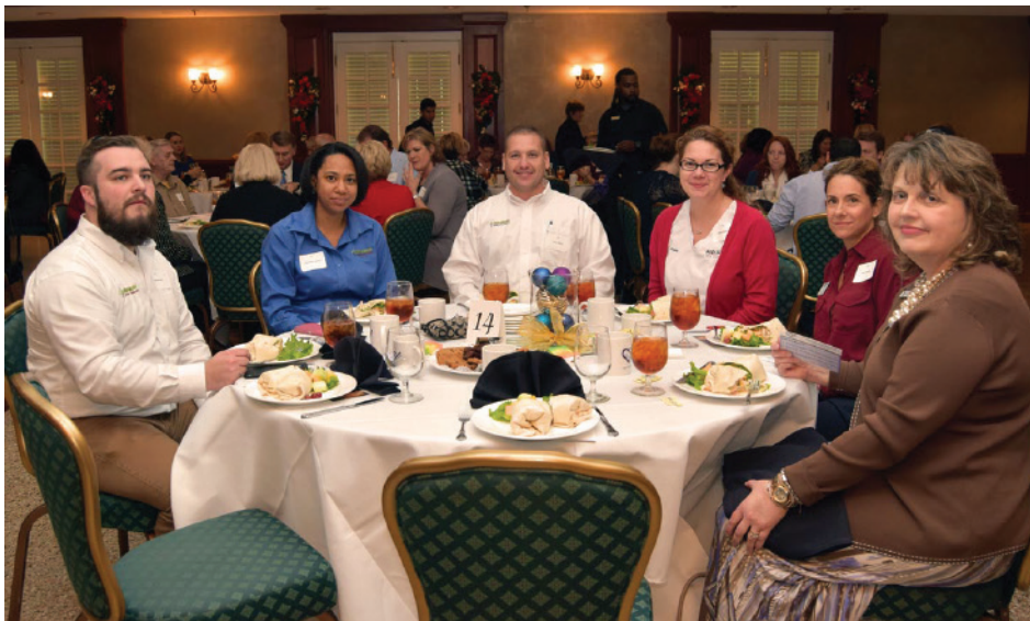
2015 Holiday Wish Luncheon- Rolling Hills Country Club