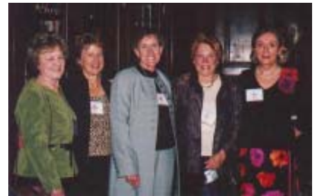
Dames of the Loyal Legion are well represented at the Friday evening reception