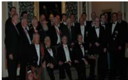
120th National Congress Attending Companions the Pledge of Allegiance and the singing of our National Anthem. Glasses were