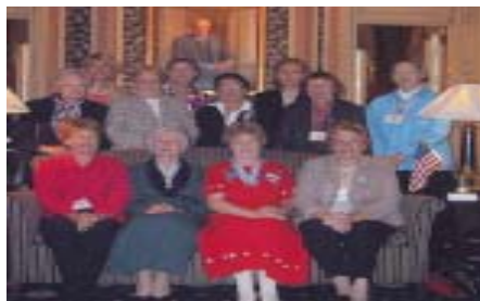
Dames of the Loyal Legion following their business meeting at the Union League