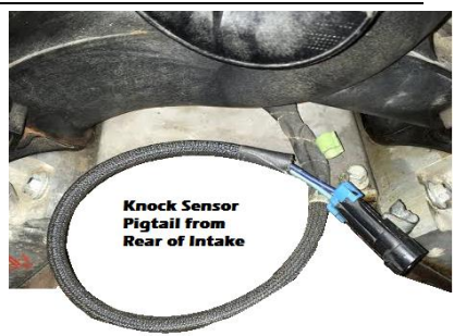
Gen 3 24x Located at Rear of Block