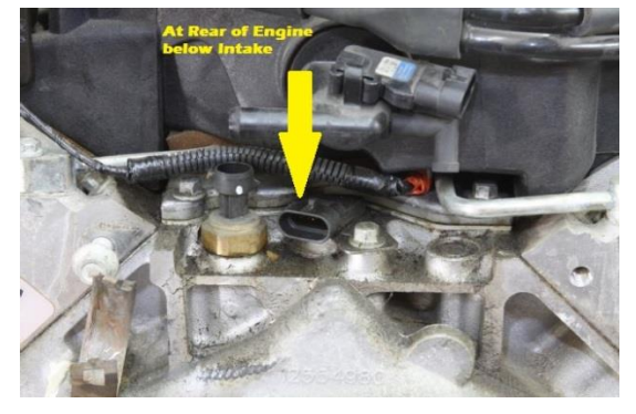
Gen 3 24x