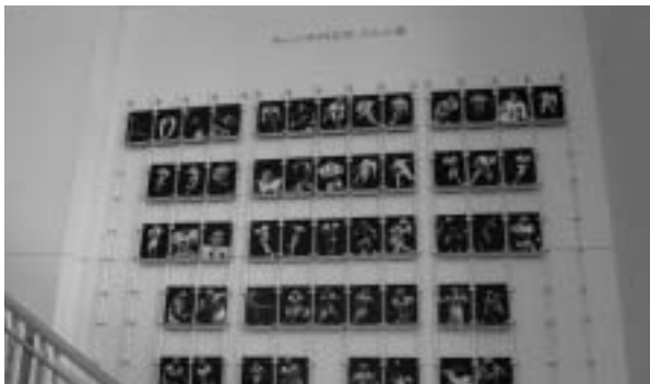
LSU's 65 All-Americans are on display in the atrium.