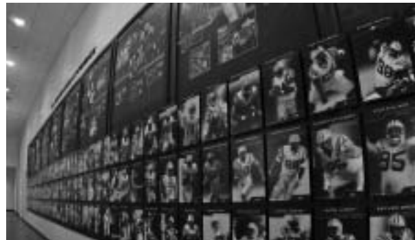
LSU's 202 first-team All-Southeastern Conference selections are honored on a wall outside the weight room. Images of each decade in LSU football history span along the top of the display.