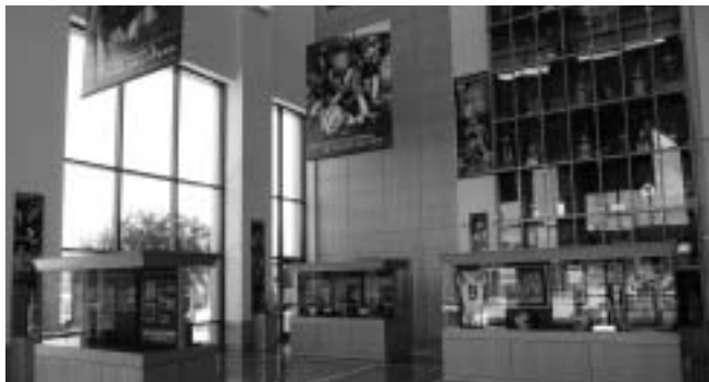
The atrium of the Football Operations Center houses over 50 trophies displaying the great moments in LSU football history. Here the past and present of LSU football is celebrated with memorabilia that dates back to the 1930s.

LSU's Football Operations Center is an all-in-one facility that includes football offices, locker room, training room, weight room, equipment room and video operations center. The $15 million facility is located on Skip Bertman Drive at the Charles McClendon Practice Facility. Built in 2006, the facility is one of the finest of its kind in college athletics, allowing more efficient time for dressing, training and practicing for the LSU football team.