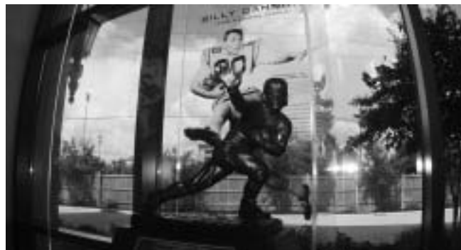
Ten individual players are honored for national awards in the atrium with the oldest trophy being the 1939 Knute Rockne Award presented to Ken Kavanaugh. Billy Cannon's 1959 Heisman Trophy (above) serves as one of the atrium's most popular displays.