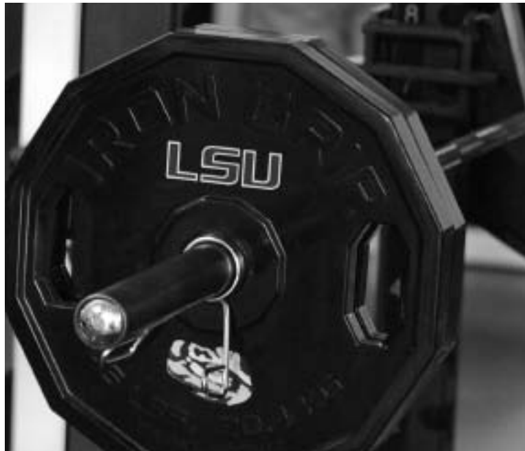
The Football Operations Center weight room features custom iron-grip dumbbells (right) and weights (above) and equipment made by Body Masters and Eleiko. An entrance (top, right) from the weight room leads to the indoor football field.