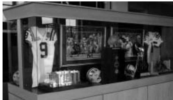
The atrium has 10 kiosks that display that honor LSU's greatest teams. This one exhibits the accomplishments of the 2007 National Championship team, including the Coaches' Trophy and the SEC Championship Trophy.