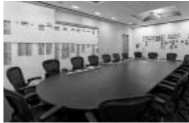
Coaches Meeting Room