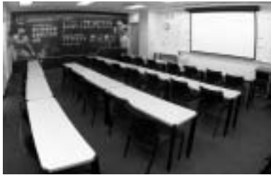
Position Meeting Room

The main auditorium, that includes 144 spacious theatre-style seats for team meetings and film sessions, has state-of-the-art audio and visual components necessary for meetings, lectures and reviewing of game footage.