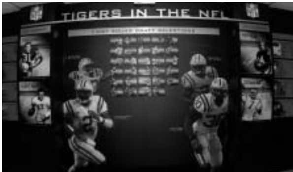
A mural outside the position meeting rooms honors LSU's first round NFL Draft picks. Helmets of all 32 NFL teams and a listing of each LSU player who has played for that respective team is also on display.

The Anderson-Feazel LSU Indoor Field is a 100-yard climate-controlled practice facility connected to the Operations Center. Built in 1991, the area is 8,250 square feet with Momentum Field Turf by SportExe similar to the Louisiana Superdome and M&T Bank Stadium in Baltimore.