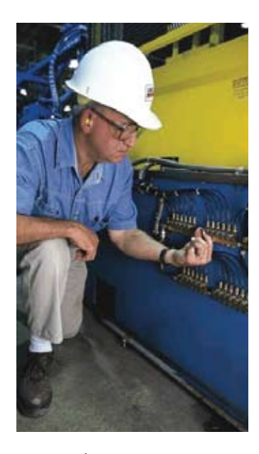
Figure 10 | A Multipoint Progressive Grease Lubrication System

Grease application volumes are proposed based on gear size, speed, lubricant type and lubricant application method. AGMA members have worked closely together to offer their best collective advice to machine owners to optimize lubricant feed frequency and volumes. Similarly to that of bearings, the principal is based on a replenishment of a small quantity of lubricant across the machine contact surfaces for a given amount of time. The faster the machine surfaces come in contact with one another