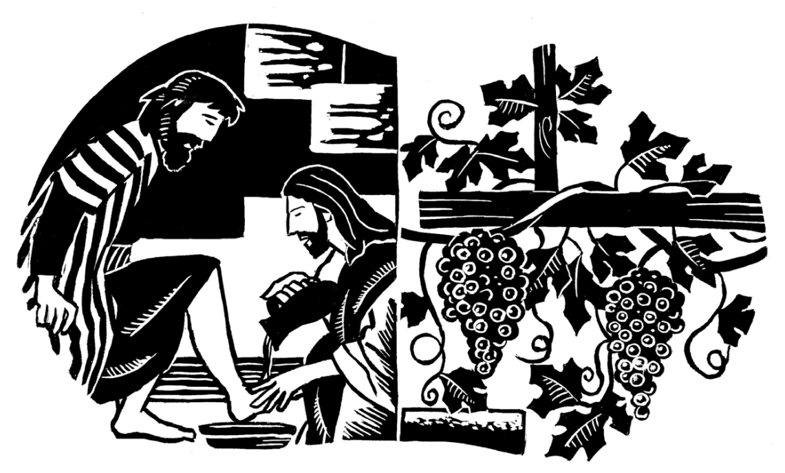
3. True or false? Jesus said every true disciple of His will be fruitful.

4. True or false? When it was time to go to the cross, Jesus did not try to avoid pain and death, but simply asked that God glorify Himself.