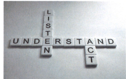
Listen, Understand, Act Image: Steven Shorrock