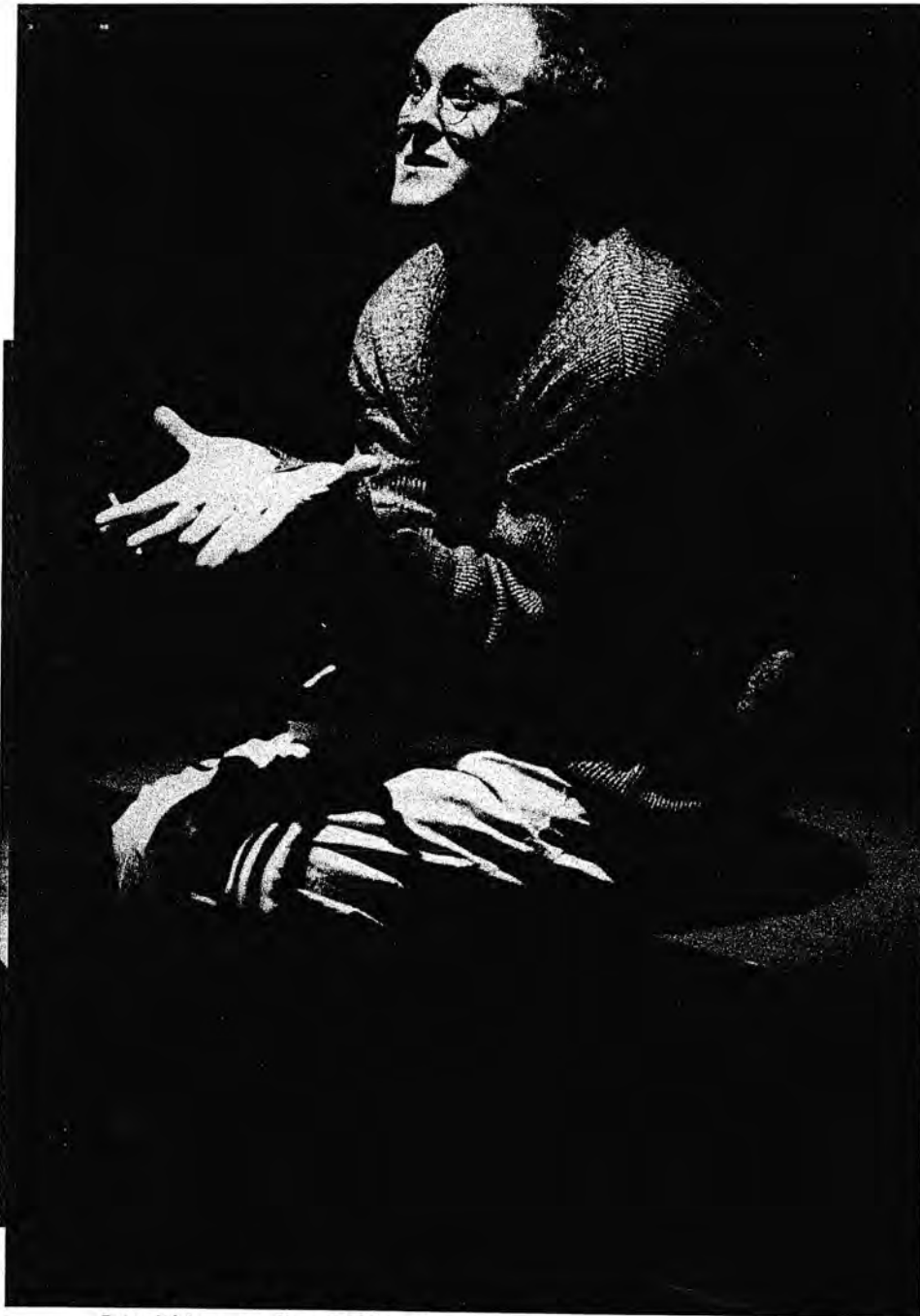
John Lithgow as Rene Gallimard

GALLIMARD: I know. There's been a lot going on in the world.