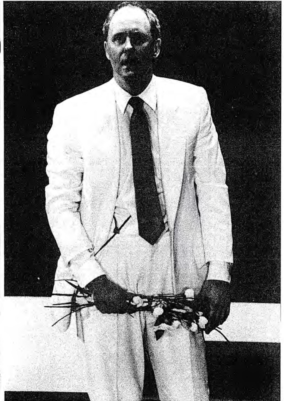
John Lithgow as Rene Gallimard

SONG: If I can't sleep, then yes, I drink. But then, it gives me these dreams which—Rene, it's been almost three weeks since you visited me last.