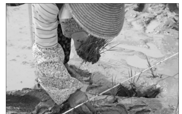
LANCE CPL. KRISTIN E. COTE

Community members line up and down the rice patty with Japanese volunteers and Tenno Elementary School students during a Youth Cultural Program rice-planting trip in Tenno June 12. The white rope had red hash marks indicating where the rice shoots should be placed.