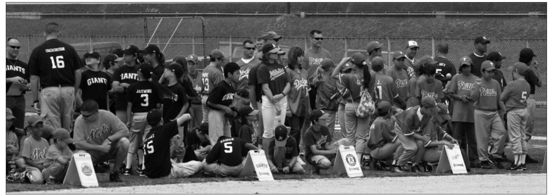
Players and coaches from all 21 teams wait in anticipation on the edge of the infield to have their team called to the pitcher's mound to receive trophies during the 2009 Youth Baseball closing ceremony at Penny Lake here June 13. The baseball season was open to station residents as well as Japanese nationals between the ages of 3-12.