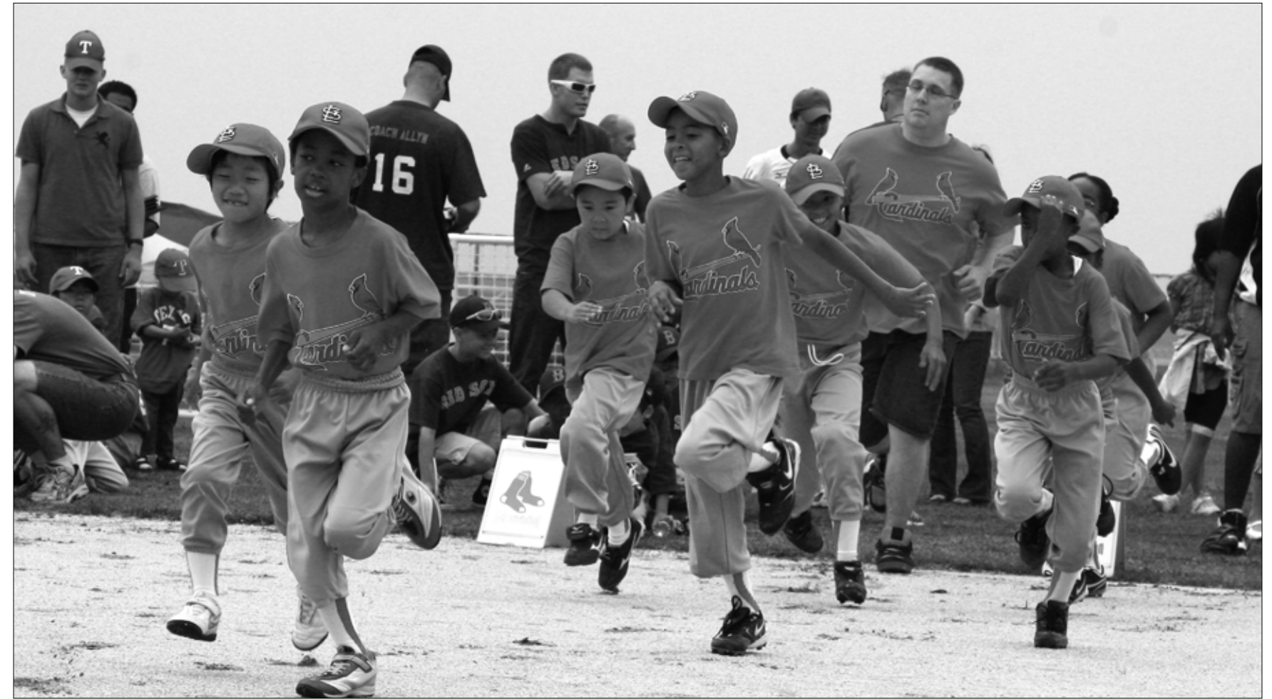
Players and coaches run from the outfield to the pitcher's mound to receive their hard-earned trophies at Penny Lake here June 13. The baseball season came to an end with the closing ceremony where each player and coach received a trophy for eight weeks of competition.