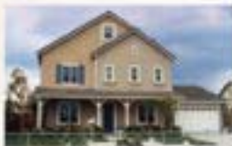
Carousel Park Corona Up to 4,193 sq. ft. Up to six bedrooms Up to 4-space garages From the 600's 951.549.0491