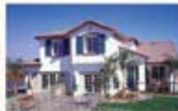
Temecula Creek North* Temecula Up to 3,609 sq. ft. Up to six bedrooms Up to 3-space garages From the high 400's 951.303.9009