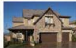
Orchard Heights Riverside Up to 3,912 sq. ft. Up to seven bedrooms Up to 3-space garages From the mid 600's 951.353.1493