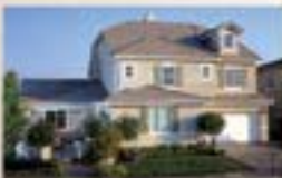
Citrus Ranch II Corona Up to to 3,968 sq. ft. Up to six bedrooms Up to 4-space garages From the mid 500's 951.549.6565

It's true. No matter how far you roam , there really is no place like home. It's a retreat where you don't have to travel far to find your favorite people and things. Home is where you cultivate, nurture, give and receive comfort, set down roots and grow wings. It reflects what is most important to you and in turn, becomes an important part of who you are. At the end of the day it is the place you want to be most of all. That is a Warmington home.