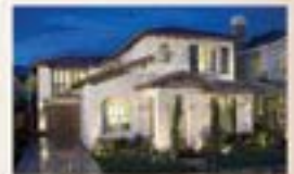
Vineyard Park* Ontario Up to 4,135 sq. ft. Up to six bedrooms Up to 3-space garages From the high 500's 909.986.4745

>> ask about our weekly home specials and quick move-ins! <<