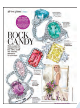
All That Glitters

Where and How to Get Married in Worldwide Destinations