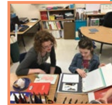
Loved Ones Day