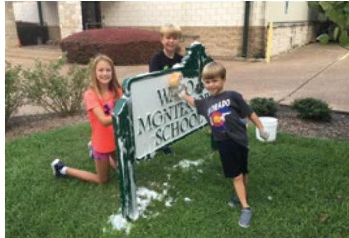
Horner kids taking care of our school sign