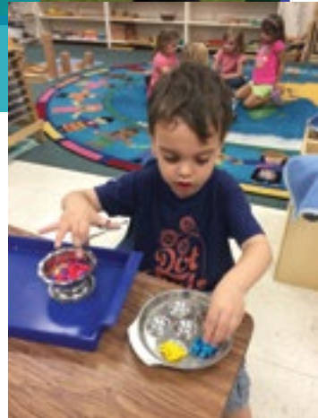
Early Childhood work