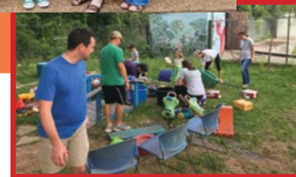
Board of Trustees serving at Talitha Kuom as an Act of Kindness