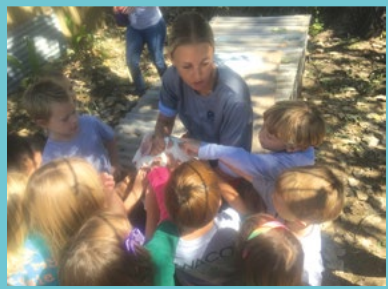
Early Childhood class field trip

The mission of Waco Montessori School is to educate children in a nurturing, stimulating environment that appreciates and celebrates each child, encourages respect for oneself and others, and develops life-long learning and problem-solving skills.