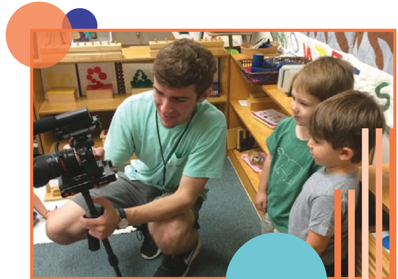
40th Anniversary video in the making