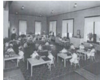
The first Montessori classroom in Waco was in the 1920's!

In addition to the practical reasons (Toddlers LOVE mud, but parents may not prefer it), this is an environmental issue. We have an opportunity to teach our kids about caring for the environment, reusing our natural resources, and caring for others. We are able to take our Montessori lessons from the classroom to the outdoors.