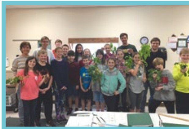
Upper Elementary collaboration with Baylor