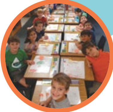
Lower Elementary Thanksgiving