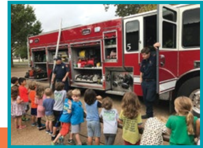
Fire Safety Week