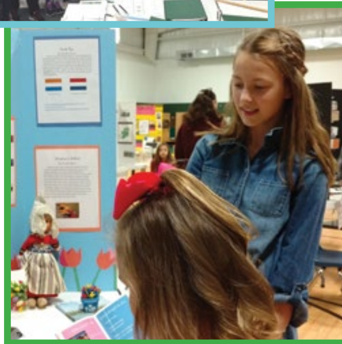
Upper Elementary Culture Fair