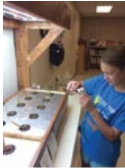
Upper Elementary students collaborated with Baylor's Entrepreneurship Program to experiment with a Hydro Garden .