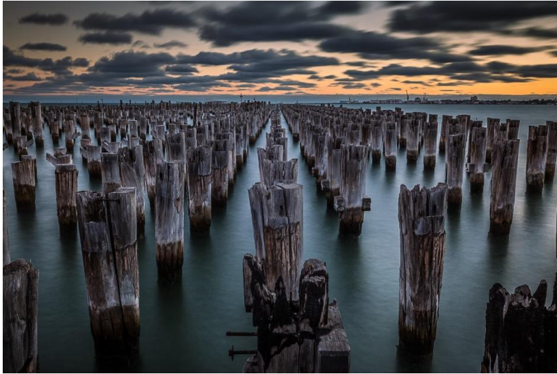
A Grade – Gold Award Soldiers United