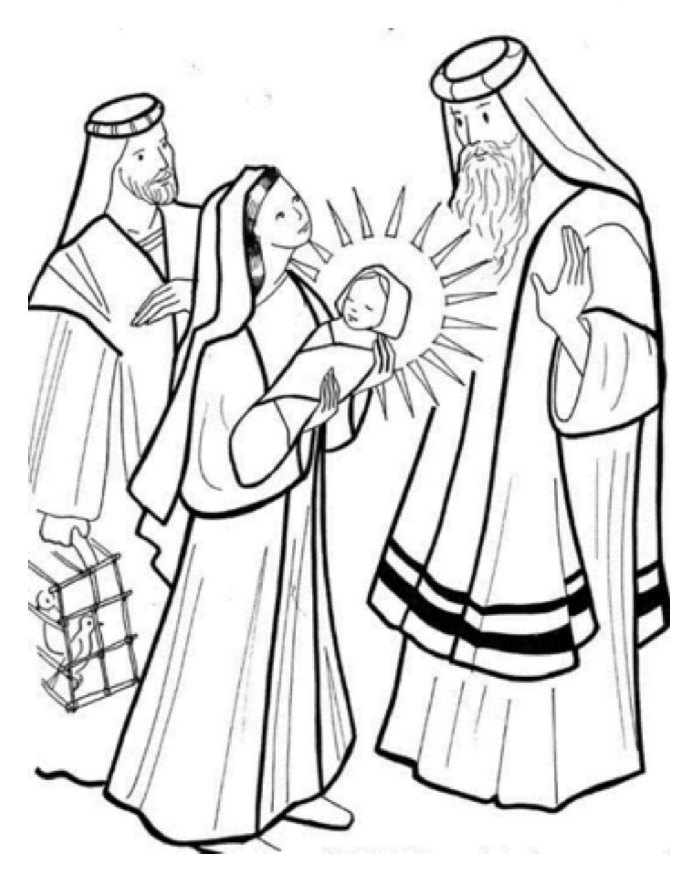
'Open me the gates of righteousness: and I will enter and give thanks to the Lord.'