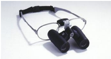
Figure 2. Prism Loupe