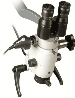
Figure 5. Components of a surgical microscope