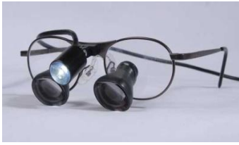
Figure1. Simple Loupe