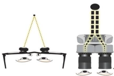
Figure 4. Comparison of vision enhancement with loupes and a microscope.