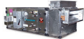
Destiny™ indoor air handler