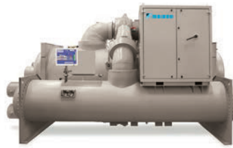
Magnitude magnetic bearing chiller