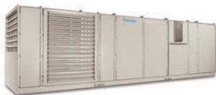
RoofPak™ outdoor air handler