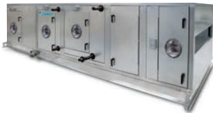
Vision™ indoor air handler