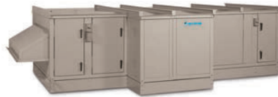
Skyline™ outdoor air handler