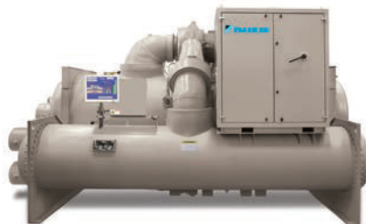
400 to 1500 ton