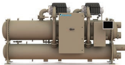
100 to 400 ton

Dual Compressors for redundancy and industry leading part load efficiency available in 100-400 ton and 800-1500 ton capacity.