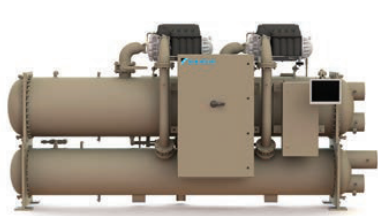
Magnitude magnetic bearing chiller