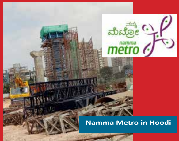
Namma Metro in Hoody