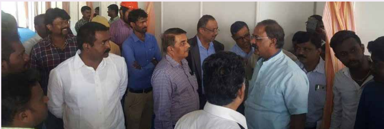
Health camp is organised at Shobha Dream acres and surrounding villages of Belagere road in Vartur ward as preventive measures to check cholera disease.