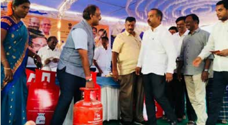
Under PM's ambitious Ujjwala scheme, LPG gas distribution at Soolikunte.