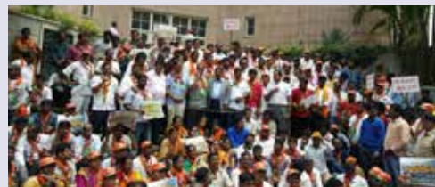
Protest against BBMP dumping garbage waste in stone quarry of Mettiganahalli and Bellahalli villages