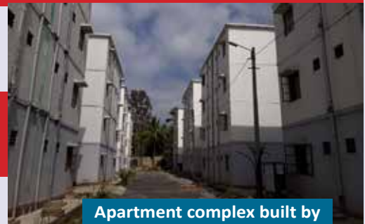
Apartment complex built by Slum board at Marath halli