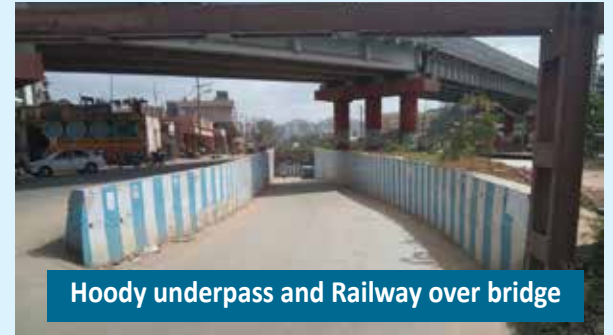
Hoody underpass and Railway over bridge

Railway over bridge at Hoody and Railway bridge at Kadugodi have been completed and open to public for better traffic flow. Railway pedestrian bridge is constructed at Kadugodi.