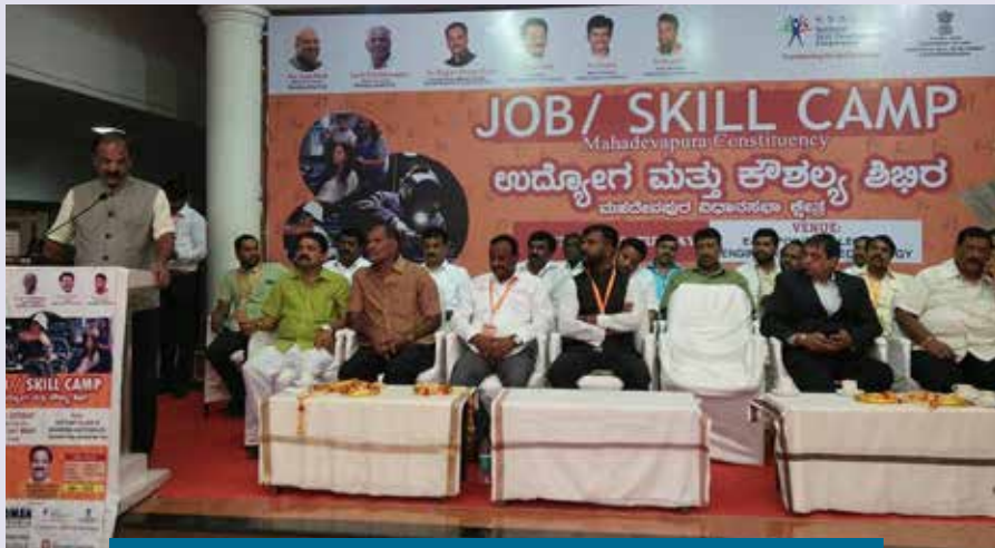
Many job melas