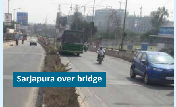
Sarjapura over bridge