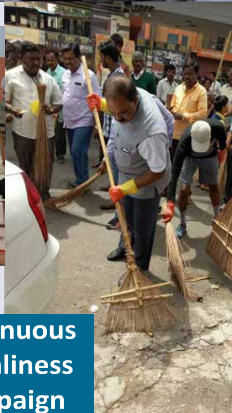
Continuous cleanliness campaign