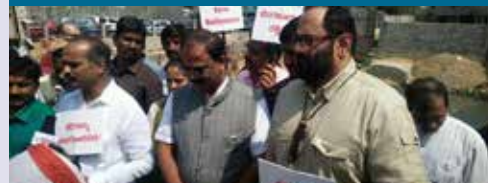
Massive protest against Bellandur lake pollution