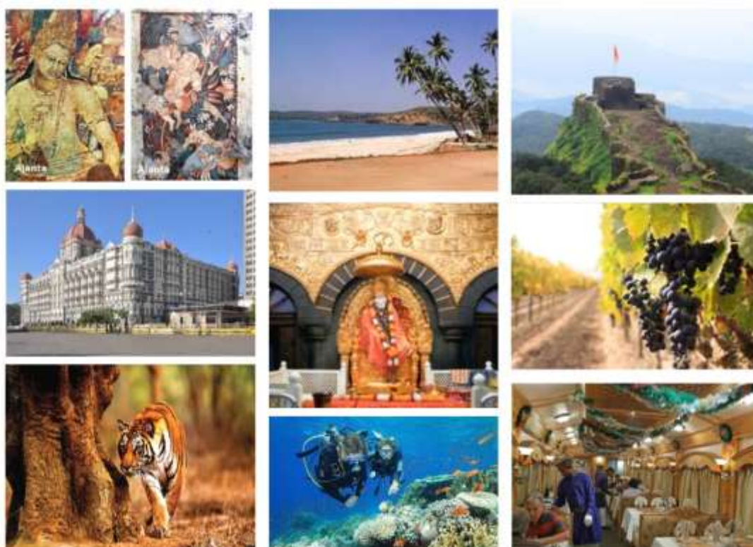
Figure 9 A snapshot on the tourism potential in Maharashtra

The state is also blessed with rich history, tradition and culture, which is evident through its world class ancient forts and monuments, ancient cave temples and pilgrimage centers. The state is the leader in the country with respect to foreign tourist arrivals (२०.८%) into India and one of the leading states for domestic tourist visits (७.२%).