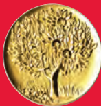
JAPAN QUALITY MEDAL 2007