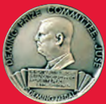
DEMING PRIZE 2003