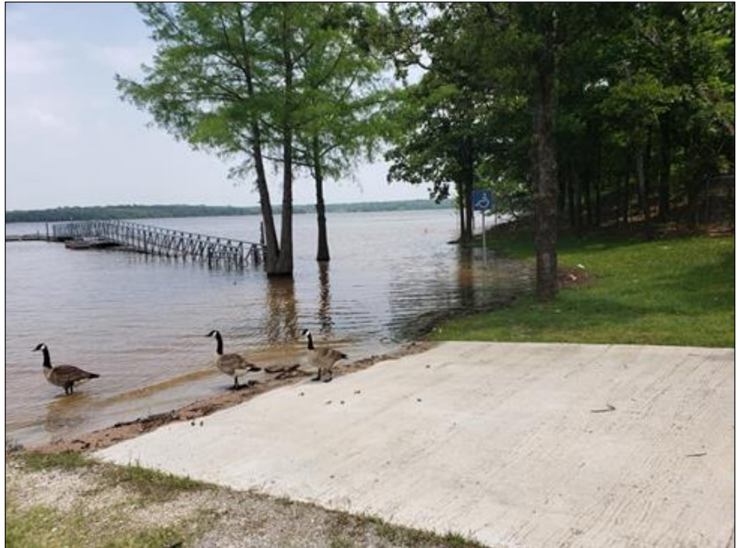
Spring rains pushed Lake Thunderbird four feet above its normal height in late May.

Jim Chapman (405) 556-1035 biker.03@att.net