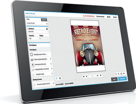
Visual Product Builder is HTML5 and desktop, tablet and mobile ready.