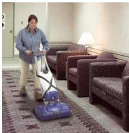
(iCapsol Mini Deluxe)

The Chariot iScrub 20's design and size make it the best-in-industry for maneuverability and 360° visibility. The Chariot iScrub 20 features a swivelling no-adjustment squeegee and Aqua-mizer Technology which helps lower water and chemical consumption, extending up to 50% greater coverage per tankful.