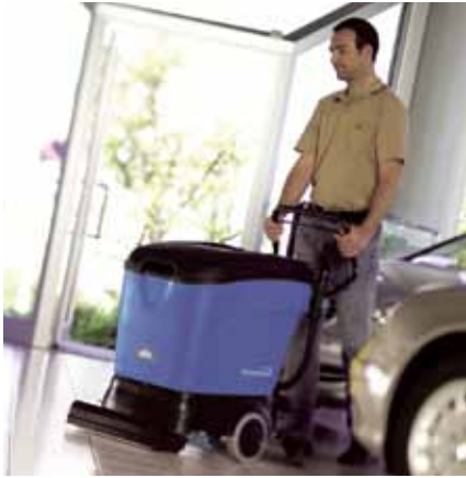
(Saber Compact 16 SP)