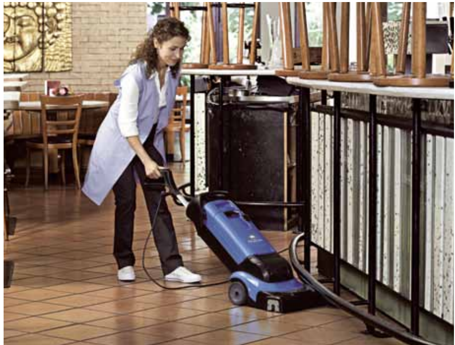
(Saber Blade 12)

The Radius Mini cordless electric sweeper provides extremely quiet operation that allows for cleaning even during business hours, making it ideal for use in hotel lobbies, restaurants and bars.