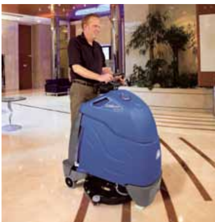
(Chariot iScrub 20)

Preserving the life and shine of your hard floors can be easy with the use of the right equipment. Windsor's Storm Series offers a variety of sizes for single-speed burnishing and a dual-speed for stripping and polishing.