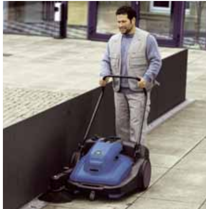
(Radius 280 Deluxe)