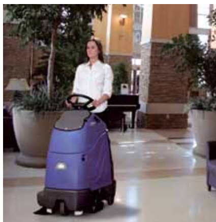
(Chariot iVac 24" ATV)

In commercial applications, a sweeper that can perform daily in congested areas is vital. The Radius 300 sweeper is built to perform fast, efficient sweeping on carpeted or hard floors. The Radius 300 also has active dust control for improved air quality.