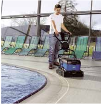
(Saber Blade 16)