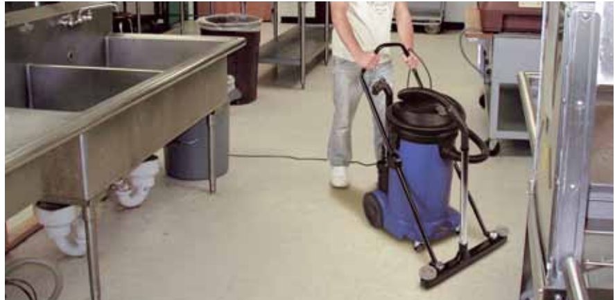
(Recover 12 w/Squeegee)

The only thing that can handle stubborn and burnt-on stains is the concentrated power of a hot-water or steam jet. Those stains are dealt with by our accessories for the Zephyr steam cleaner, such as the round pencil jet nozzle or brushes with brass bristles.