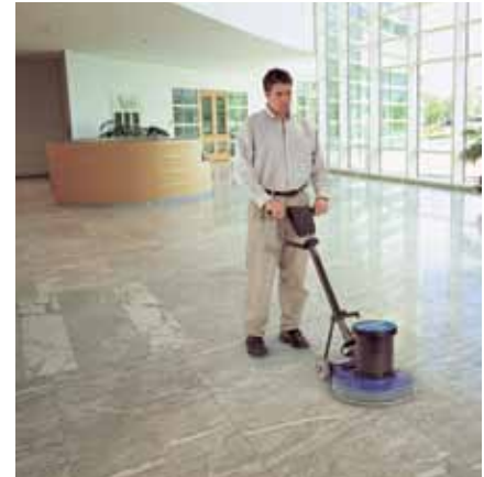
(Storm Dual Speed)

Proper carpet maintenance improves the appearance and air quality of your facility. Protecting your carpet takes a powerful, reliable vacuum. The Windsor Versamatic dual-motor system allows you to clean deep into the carpet and remove dirt that can damage your carpet.