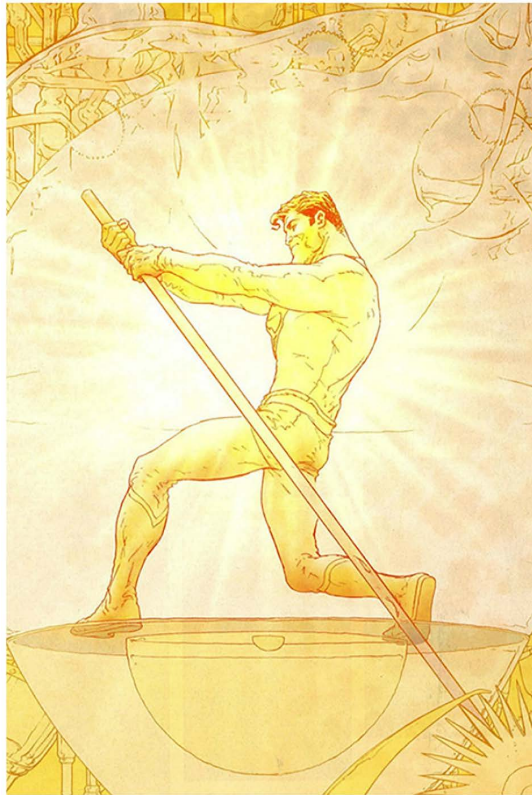
Figure 4 Superman working inside the sun.