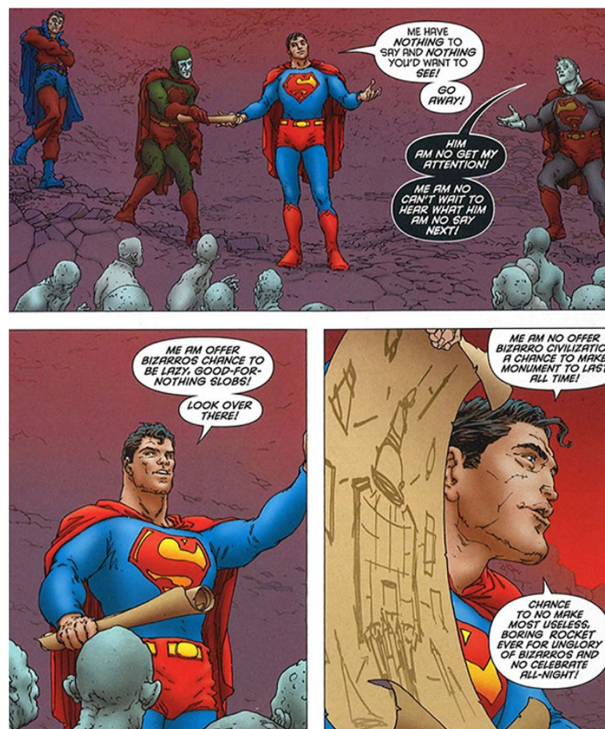
Figure 2 Superman learns to speak Bizarro English.