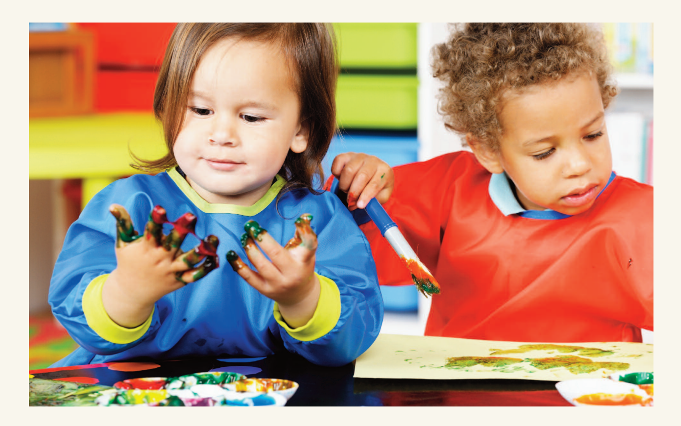
Making Prekindergarten Truly Universal in New York | October 2013

New York can and should move to close the achievement gap, improve high school graduation, and have every student college and career ready. An appropriate system of pre-K services is an essential component of a seamless pipeline of education. This proposal provides the roadmap to meet this important milestone.