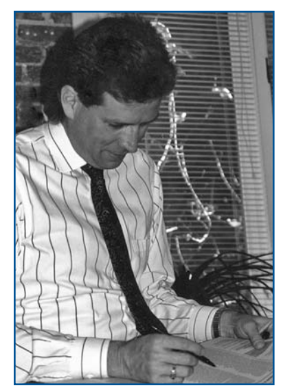
He knew he had time to write a book about living after his terminal diagnosis.

"I forgive you," "please forgive me," "I love you," "thank you," and "good-bye."