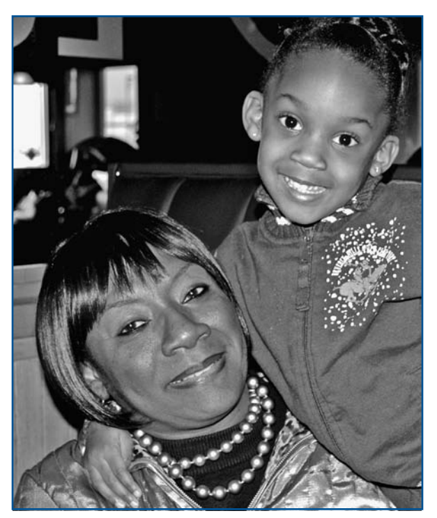
She knew she could lean on her grandmother.

Some day you may have to make decisions for someone you love – maybe a parent or your spouse. You may have tried to have a conversation and been told that they don't want to talk about it. Sharing your Caring Conversations <sup>®</sup> workbook may help. If it doesn't, ask for their help. Tell them that you love them and, if you ever have to make decisions for them, you want to know you are doing what they want. You might say, "Dad, I need you to do this for ME. I need your help now while we can have this conversation – long before we need it."