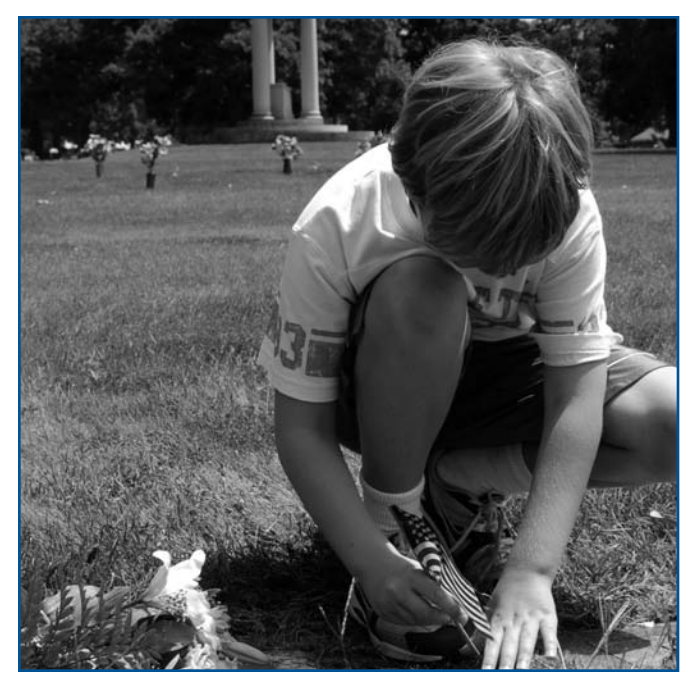
A child's love does not end.

Setting the example is a great motivator for others to follow your lead. Share your Caring Conversa tions <sup>®</sup> workbook and encourage others to take advantage of this tool to make their wishes for end-of-life care known.