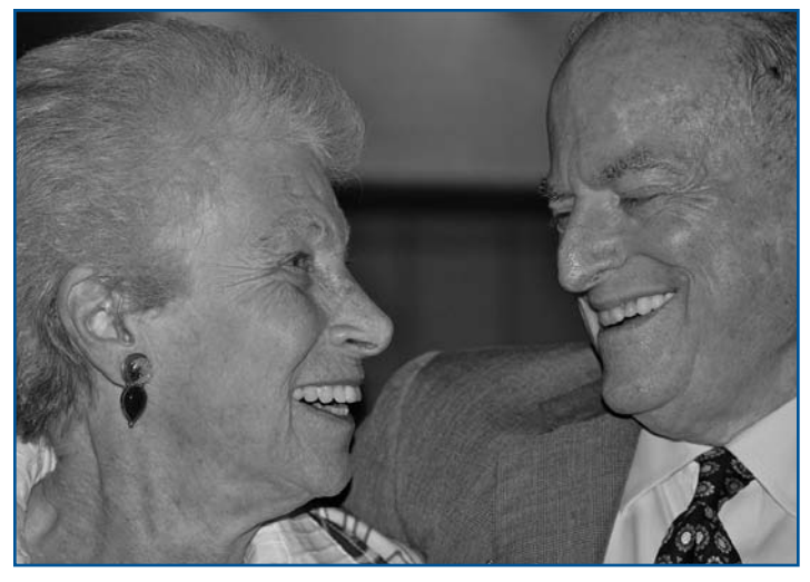
They believe that talking about end-of-life wishes is a gift that we should give each other.