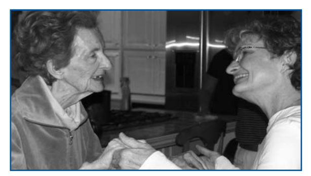
She always loved music and singing even when the words would not come.

Would you want palliative care (treatment of your symptoms to make you more comfortable) to manage conditions like nausea, breathing, anxiety, fatigue and sleep?