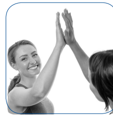
Manage Stress -