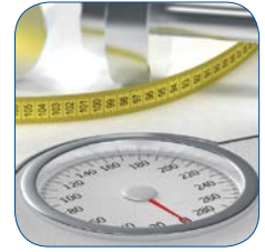
Strive for a Healthy Weight -