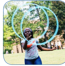
Be Physically Active