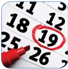
Be Tobacco Free