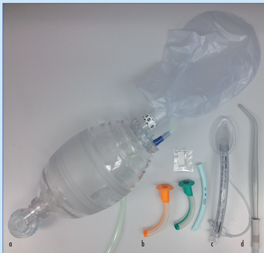
Figure 2. Adjuncts for supporting airway and laryngeal mask. a. Bag-valve-mask system with high flow oxygen source. b. Oropharyngeal and nasopharyngeal airways. c. Laryngeal mask. d. Wide-bore rigid sucker.

A secure airway is one in which the trachea and bronchial tree are protected from aspiration of gastric contents or secretions by the presence of a cuffed endotracheal tube (or a tracheostomy). This is the gold standard for an unconscious patient at risk of aspiration, but should only be attempted by those trained and familiar with the technique of tracheal intubation. This will