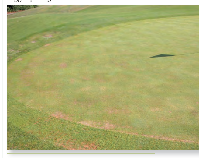
This creeping bentgrass green is infected with anthracnose basal rot. The most severe damage appears in high-traffic or stress areas.

ther complicated by a lack of understanding of the disease biology. Scientists have not yet discovered where the pathogen overwinters in the turf canopy and what specific environmental conditions trigger pathogen activation and initial infection