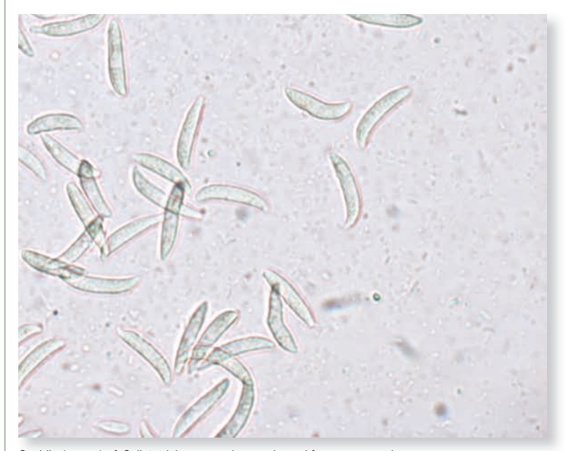
Conidia (spores) of Colletotrichum cereale are released from an acervulus.

Figure 2. Comparison of phosphonate fungicides for anthracnose control on annual bluegrass. Data were collected July 5, 2005, following five applications on 14-day intervals. The active ingredients for the products listed are: fosetyl-Al (Aliette, Chipco Signature) and potassium phosphite (Alude). Redrawn from Cook et al. (5).