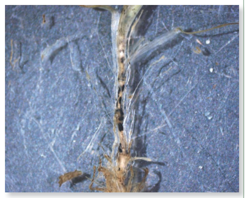
Colletotrichum cereale has infected this creeping bentgrass stolon with anthracnose basal rot. The dark spots are acervuli.