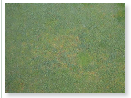
This creeping bentgrass shows characteristic symptoms of anthracnose basal rot.

<sup>†</sup>p, preventive; c, curative. <sup>§</sup>Not labeled for use at this time, but in late stages of commercial development.