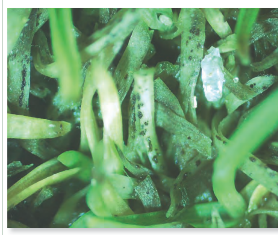
Anthracnose foliar blight of annual bluegrass, with diagnostic acervuli and setae embedded in the diseased leaf tissue.

Table 4. Active ingredients showing acceptable control in various field trials conducted by NE-1025 researchers.