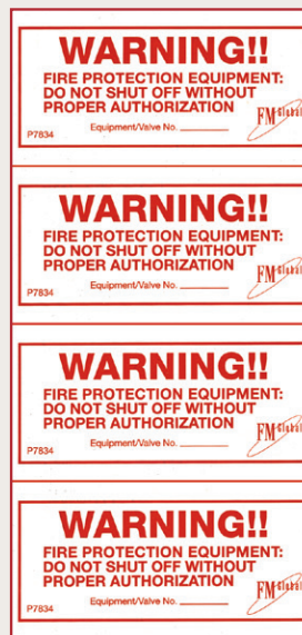
B. Fire Protection Equipment Decals (P7834)