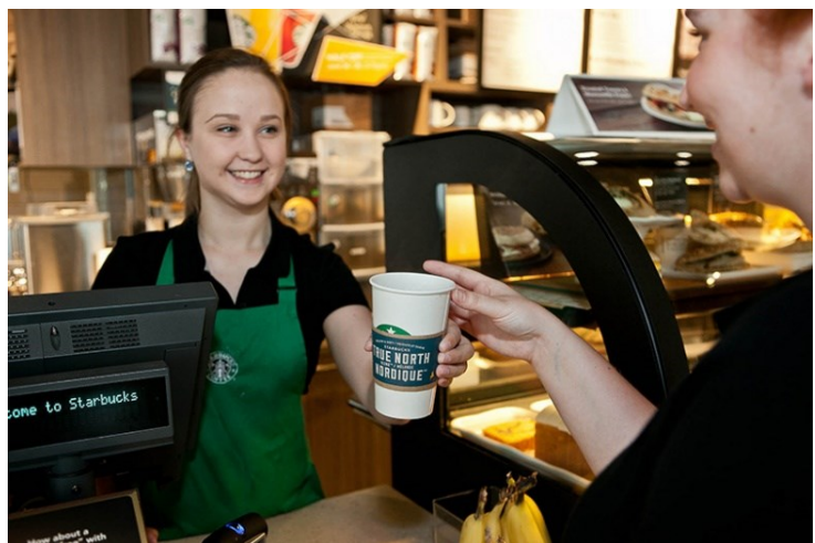
Figure 11.2: A Starbucks barista serving a customer

Employees at Starbucks are vital to the company’s success. They are its public face, and every dollar of sales passes through their hands. 6 According to Howard Schultz, they can make or break the company. If a customer has a positive interaction with an employee, the customer will come back. If an encounter is negative, the customer is probably gone for good. That’s why it’s crucial for Starbucks to recruit and hire the right people, train them properly, motivate them to do their best, and encourage them to stay with the company. Thus, the company works to provide satisfying jobs, a positive work environment, appropriate work schedules, and fair compensation and benefits. These activities are part of Starbucks’s strategy to deploy human resources in order to gain competitive advantage. The process is called human resource management (HRM) , which consists of all actions that an organization takes to attract, develop, and retain quality employees. Each of these activities is complex. Attracting