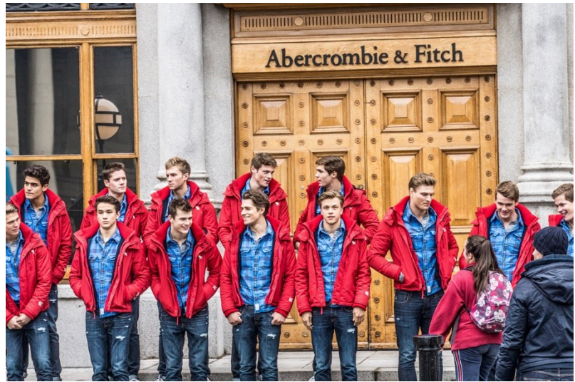
Figure 11.6: Models pose at the grand opening of an Abercrombie and Fitch store in Ireland, 2012.

Reasons for building a diverse workforce go well beyond mere compliance with legal standards. It even goes beyond commitment to ethical standards. It's good business. People with diverse backgrounds bring fresh points of view that can be invaluable in generating ideas and solving problems. In addition, they can be the key to connecting with an ethnically diverse customer base. If a large percentage of your customers are Hispanic, it might make sense to have a Hispanic marketing manager. In short, capitalizing on the benefits of a diverse workforce means that employers should view differences as assets rather than liabilities.