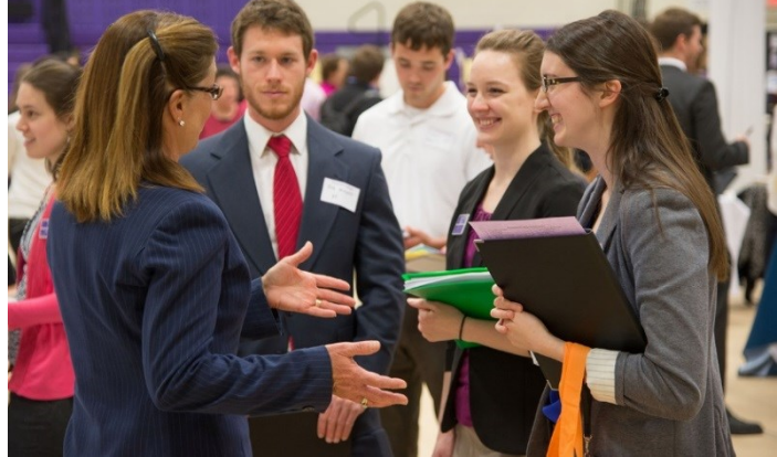
Figure 11.4: Students talking to a recruiter at a college campus job fair