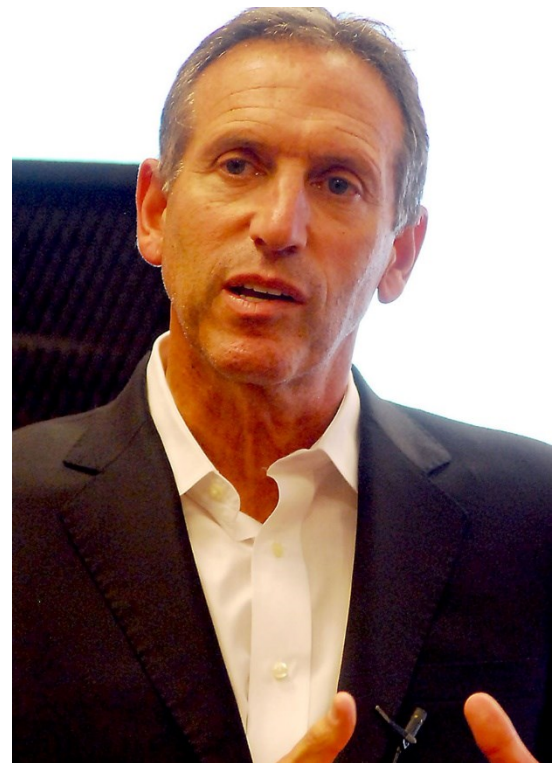
Figure 11.1: Starbucks founder Howard Schultz