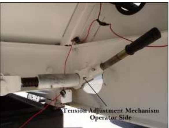
Figure 3A Figure 3B