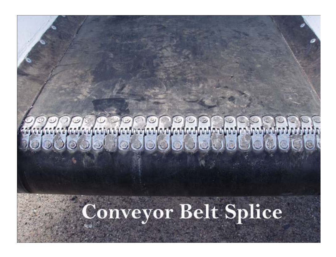
Figure 4 B