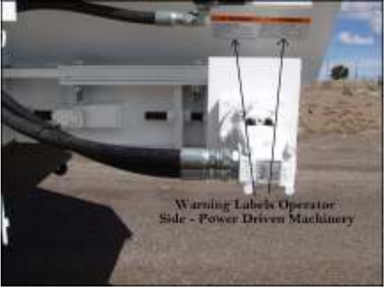
Figure 2C Figure 2D