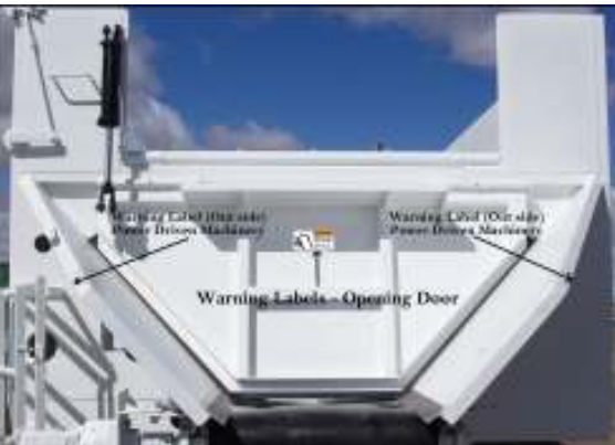
Figure 2A Figure 2B