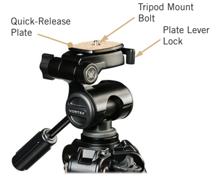
Flip the plate lever to lock/unlock plate.