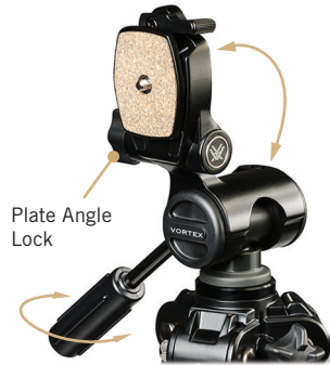
Control pan and tilt action with the handle.

You can control all of the pan and tilt action with just one hand. To make any horizontal or vertical adjustments, twist the handle counter-clockwise to free the pan head's movement. When in desired position, twist handle clockwise to lock.