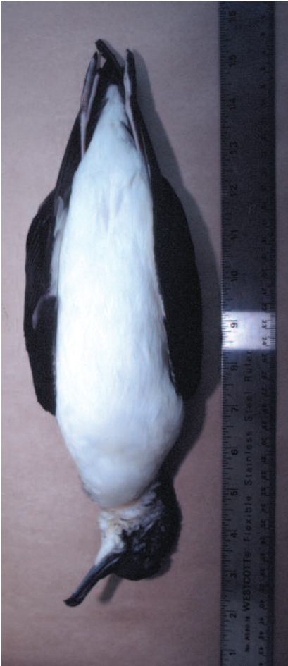
Figure 1: Manx Shearwater found dead at Shirley's Bay, Ottawa, 26 August 2001.