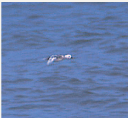
Figure 1. A leucistic female Common Goldeneye, 8 December 2001, Stony Creek, Niagara R.M.