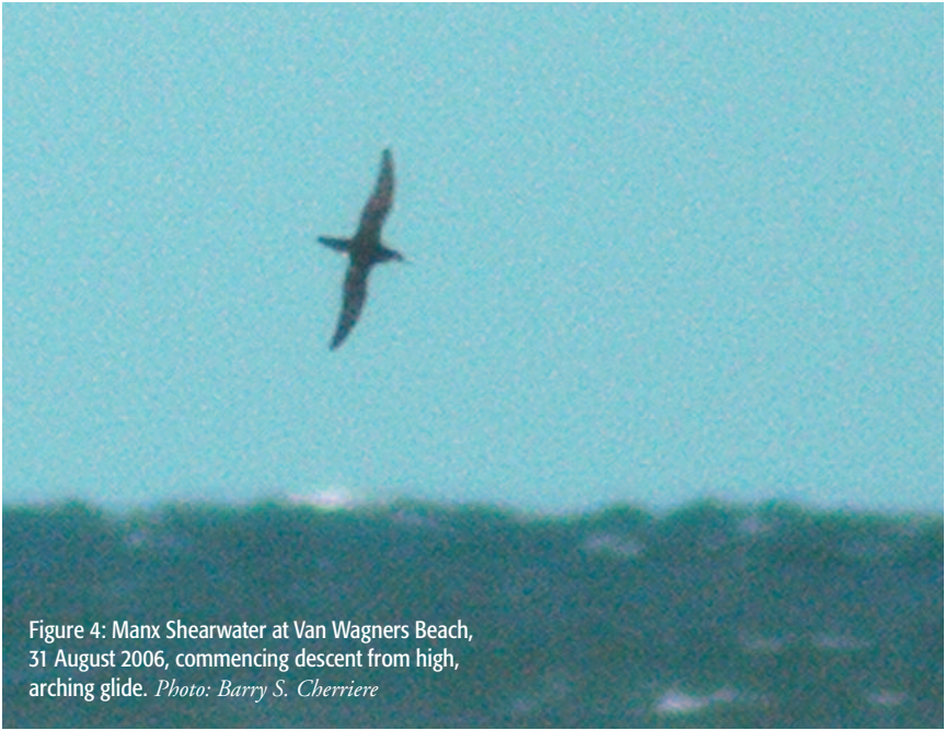
Figure 4: Manx Shearwater at Van Wagners Beach, 31 August 2006, commencing descent from high, arching glide.

the lake several more times over the next hour or so. However, as birders began to gather, the bird was not being seen. Fortunately, at 1830h, the gathered group was treated with two “fly-bys”. The shearwater flew past from east to west at an estimated distance of 200 m then, presumably finding itself cut off by the end of the lake, returned from west to east at a distance of approximately 400 m. On this second pass Cherriere obtained photographs (Figures 2 – 4).