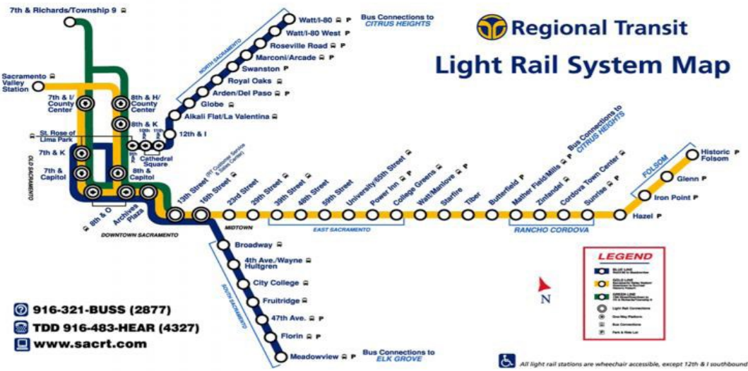
MAP of DOWNTOWN SACRAMENTO