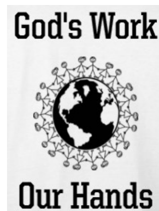
Back of shirt