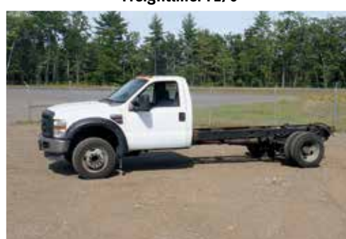
2008 Ford F550 XL