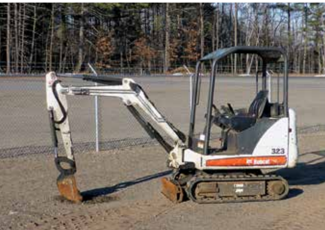
2009 Bobcat 323