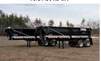
Ford F150 XL 4x4