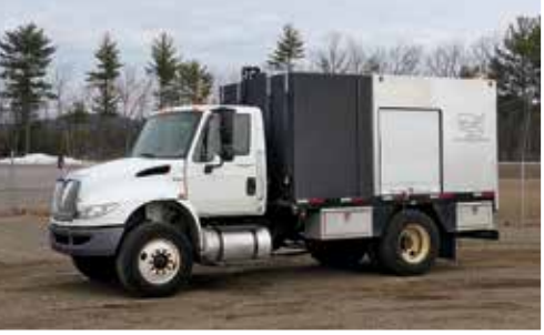
2009 International 4400SBA DuraStar w/Sewer Equipment of America 800-HPR