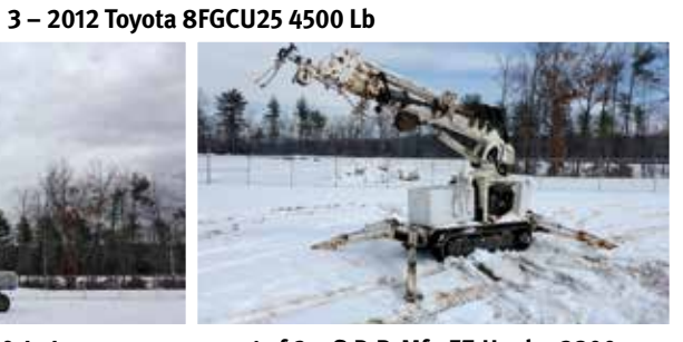
1 of 2 - S.D.P. Mfg EZ-Hauler 3800