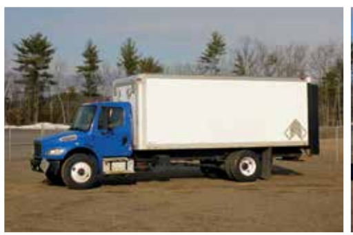
2009 Freightliner M2 Business Class