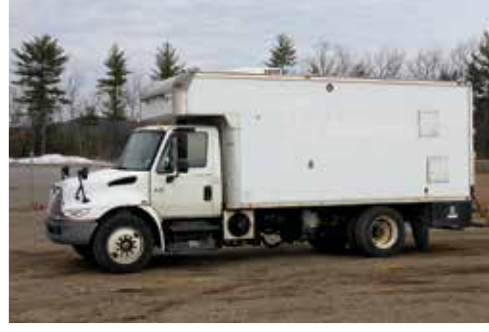
International 4300SBA w/Aries SYS-138