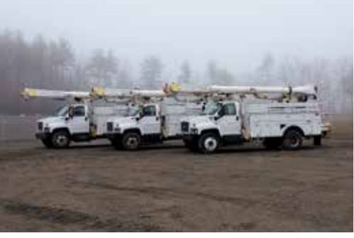
3 - Chevrolet C7500 w/Altec AM855