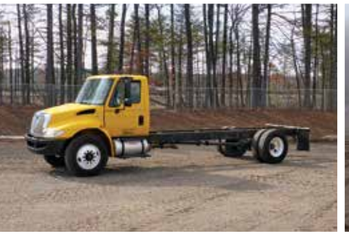
2011 International 4300SBA DuraStar