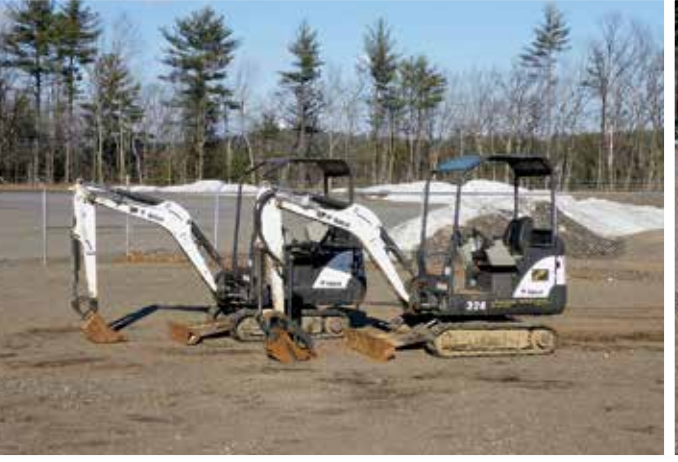
2013 & 2014 Bobcat 324