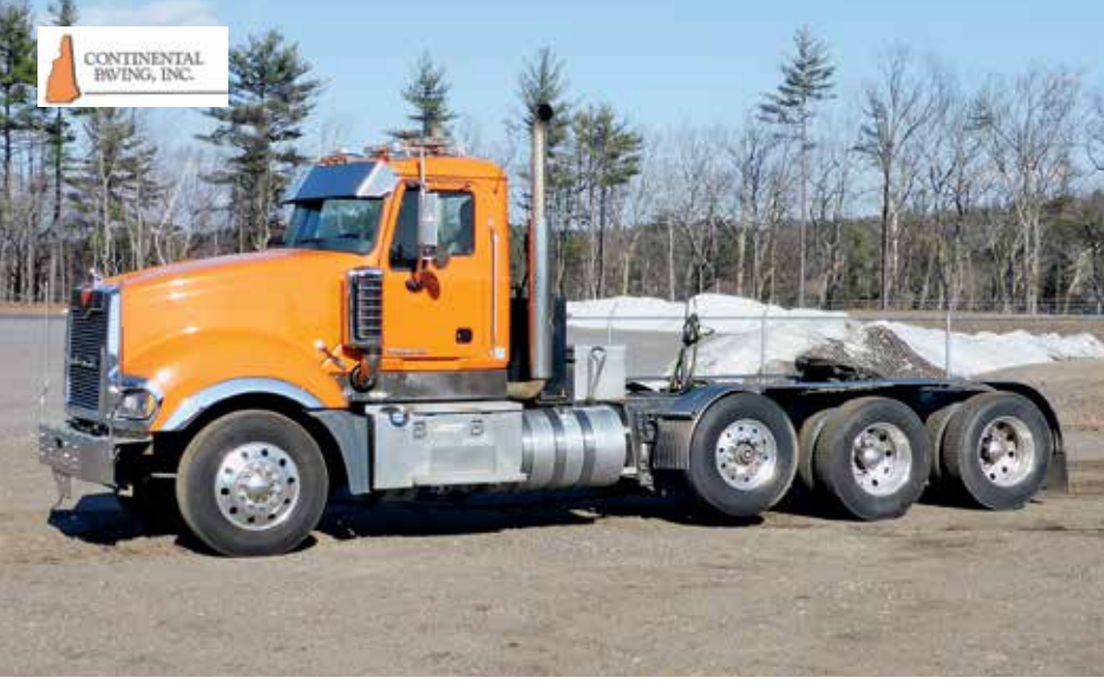
2011 Mack TD713 Titan Heavy Haul