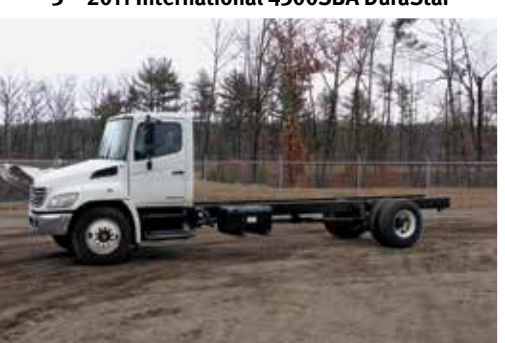
2008 Hino 338