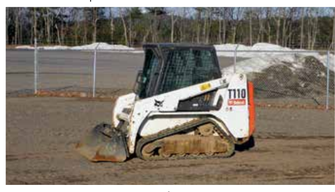
2015 Bobcat T110

Forklifts • electric forklifts • boom lifts • landscape equipment • recreational vehicles • air compressors • light generator sets • pumps • pipeline equipment • container equipment • drill parts & accessories • equipment attachments • truck attachments • industrial items • shop & warehouse items • parts / stationary – construction & transportation.