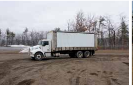
2008 Kenworth T300