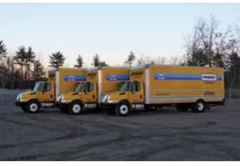
3 - 2011 International 4300SBA DuraStar