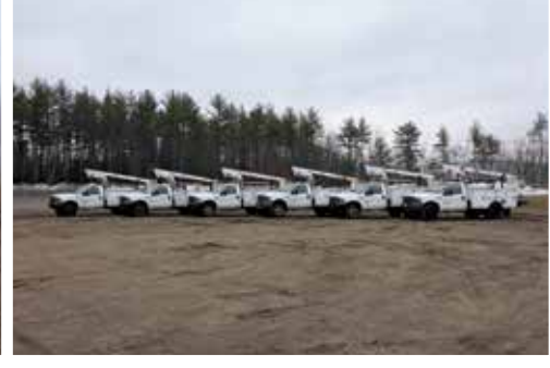
6 of 11 - Ford F450 XL w/Telsta A28D