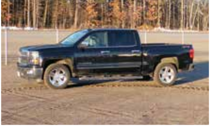
2015 Chevrolet 1500 LTZ 4x4