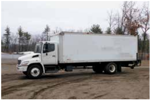
2008 Hino 338