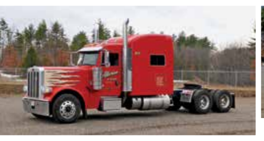
2014 Peterbilt 389