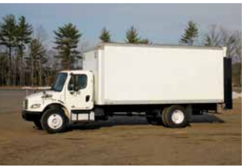
1 of 3 – 2011 Freightliner M2 Business Class