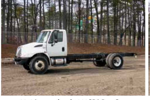
2012 International 4300SBA DuraStar