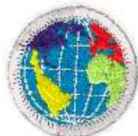
Citizenship in the World