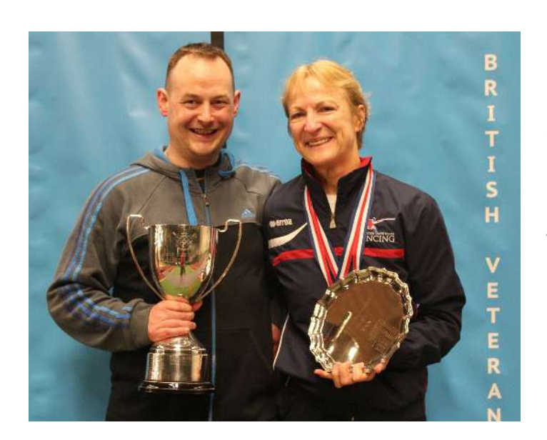
Champions at Arms