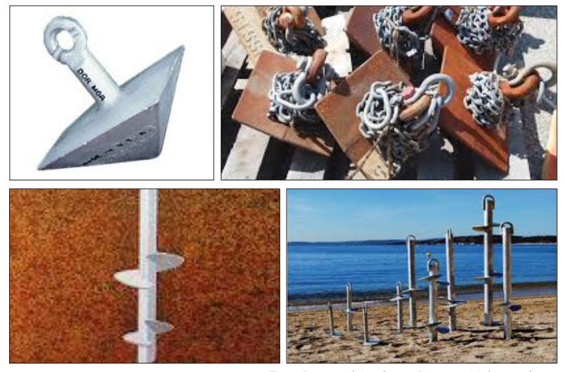
Top: Pyramid Anchors; Bottom: Helix Anchors

varying diameters of threads (10", 14"). To set the anchor, they are screwed in until the top eye is essentially flush with the bottom connected to traditional ground tackle. While screw-in or helix anchors have been used by the offshore oil industry for well over 20 years, they are a relatively new technology in anchoring systems for the yachting and smaller commercial vessel markets. Recent industry tests are showing that these anchors can offer significantly more holding power