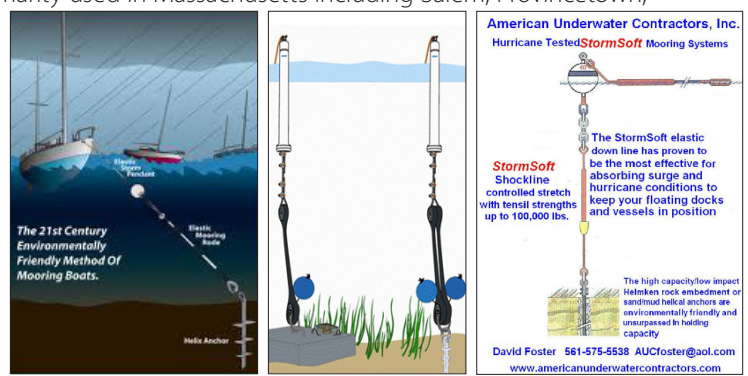
Left: Illustration of Eco-Mooring; Middle: Illustration of Hazelett Elastic Mooring System; Right; Illustration of Stormsoft Elastic Boat Mooring System

Gloucester, Nantucket and Chatham. Some harbors in Maine have started to explore the use of conservation mooring components. Wells Harbor, for example, has begun to install a limited number of helix anchors. The Town of Mount Desert has installed a Habitat Mooring as a test mooring in Seal Harbor. According to the Urban Harbors Institute, several Harbors in Massachusetts.