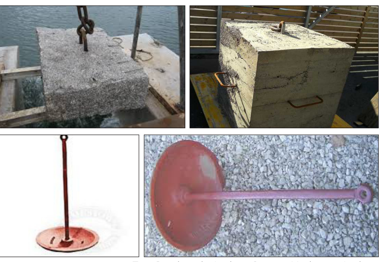
Top: Deadweight Anchors; Bottom: Mushroom Anchors

Mushroom Anchors. Mushroom anchors get their name from their shape, which looks like an upside down mushroom. They work best in mud, sand, silt or other soft ocean bottoms where they can be easily buried. Once buried, a mushroom mooring is typically thought to be able to hold up to 10 times its weight. In certain conditions, mushroom