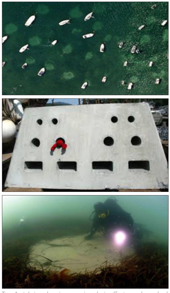
Top: Aerial view showing mooring chain effect on eelgrass bed; Middle: Habitat mooring; Bottom: Diver looking at damage to eelgrass bed from mooring

Conservation style rodes also have added benefits during storm events. While the lines used on a conventional moorings has some stretch, conservation rodes are specifically designed to stretch, generating more horizontal holding force earlier in the boats movement.