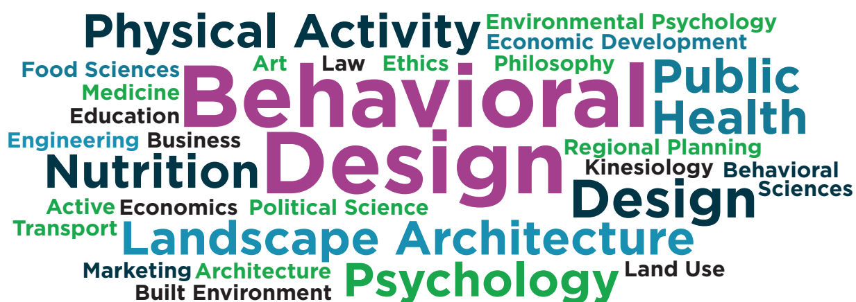
FIGURE 1: EXAMPLES OF DISCIPLINES CONTRIBUTING TO BEHAVIORAL DESIGN

This multidisciplinary effort is fostered within NCCOR, which brings together four of the nation's leading health research funders—the Centers for Disease Control and Prevention (CDC), the National Institutes of Health (NIH), the Robert Wood Johnson Foundation (RWJF), and the U.S. Department of Agriculture (USDA)—to address the problem of childhood obesity in America. These leading national organizations work in tandem to manage projects and reach common goals; combine funding to make the most of available resources; and share insights and expertise to strengthen research. NCCOR focuses on efforts that have the potential to benefit children, teens, and their families, and the communities where they live, learn, work, and play. NCCOR places a special emphasis on the populations and communities where obesity rates are highest and rising the fastest, namely: African-Americans, Hispanics, Native Americans, Asian/Pacific Islanders, and children living in low-income communities.