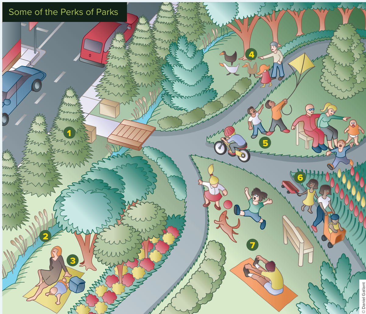
Figure 3: USING PARKS TO IMPROVE CHILDREN'S HEALTH

Although there's still a lot to learn about the true health impact of park prescriptions, many studies suggest that spending time outdoors can offer a variety of health benefits by an equally wide variety of means.