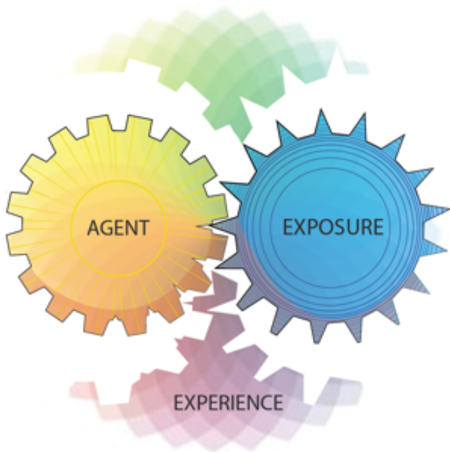
FIGURE 2: OUR EXPERIENCE AS AN INTEGRAL PART OF BEING AN AGENT WITHIN A FIELD OF EXPOSURE.

Behavioral design’s maturation requires drawing from the base domains of human experience to explore, contextualize, and guide our understanding of the relationship between our actions and the natural and built environment. 33,34 The importance of a domain-level approach should not be underestimated. Because this approach goes beyond systems or even ecologic approaches and, if done with care, enforces considerations from the different ways we think and act. Moreover, a domain-level approach tempers and guides behavioral design to respect and protect freedom, rights, autonomy, and, in general, sovereignty. Developing a methodological approach to behavioral design assists our ability to be effectively inclusive of the complex nature of humans and the potential to modify our world toward particular ends. Ideally such an approach is guided and informed by an overarching conceptual framework containing principles representing the fundamental domains and a methodology