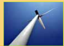
GTMO Green page 5