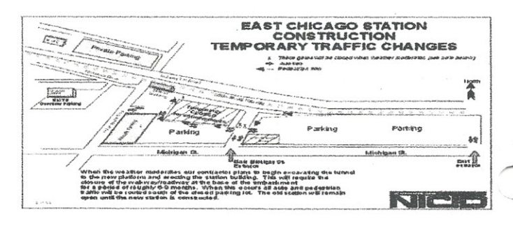
(Cont on page 7)