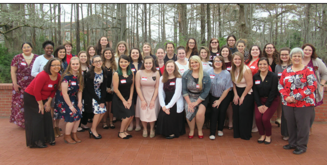
Chapters gathered for Province Days in February. At top, members of Rho A and Rho B. At bottom, members of Omega A.