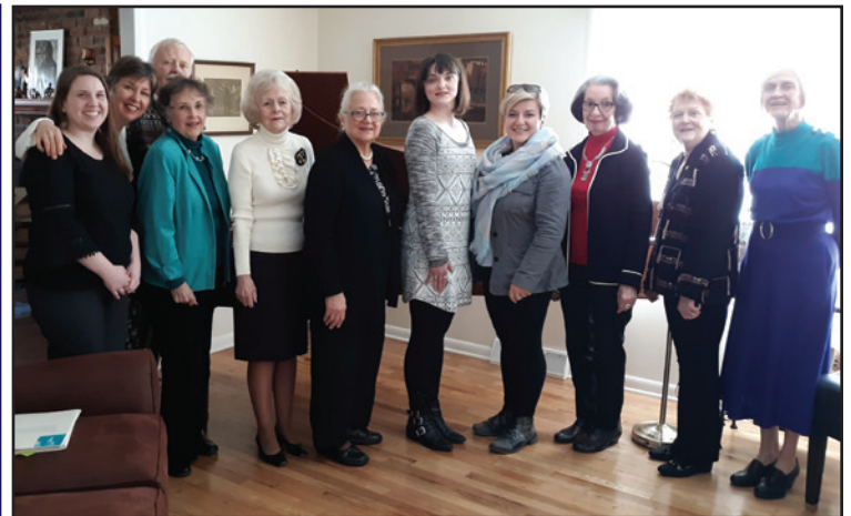
Members of the Bloomington Indiana Alumnae Chapter.