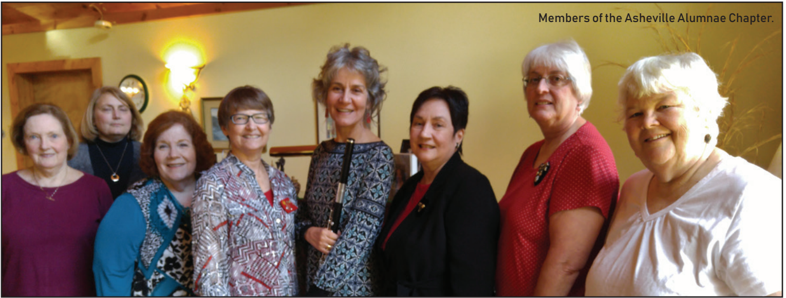
Members of the Asheville Alumnae Chapter.

ASHEVILLE (NC) – Greetings from Asheville, NC! In our second year, the chapter is still on the move with Fraternity and Community Enrichment (FACE) where we choose a musical group to offer support to during the year. Pan Harmonia, an eclectic collection of performers ranging from bagpipers to bassoonists, was selected this year.