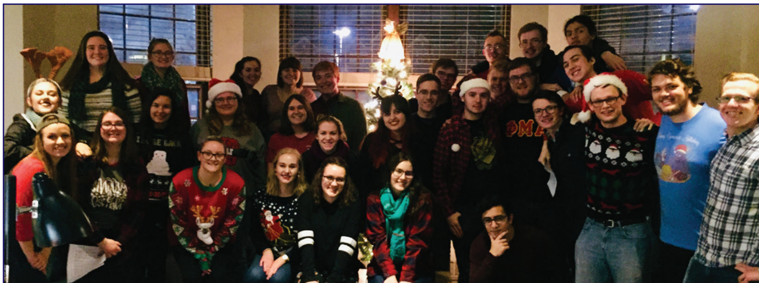
Delta Tau members caroled with members of the Augustana College Phi Mu Alpha Chapter.