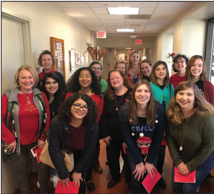
Members of the San Antonio Alumnae Chapter and Theta Gamma caroled at the oncology ward of the local Methodist Hospital.

TEMPO! MARCH 2019 ONE TUNNEL ROAD ASHEVILLE, NC 28805