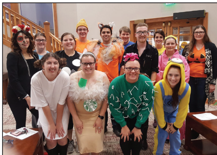
Kappa Upsilon performed Pumpkin Caroling during Halloween.

One of Kappa Upsilon's traditions is going caroling at Meadowlark Hills, a retirement community in Manhattan, KS. In October, we went "Pumpkin Caroling," a fun twist on Christmas carols by replacing the lyrics with Halloween-related words. In December, we went Christmas caroling and invited the brothers of Phi Mu Alpha Sinfonia's Tau Chapter to join us. Residents joined us in singing and even playing the piano. Some