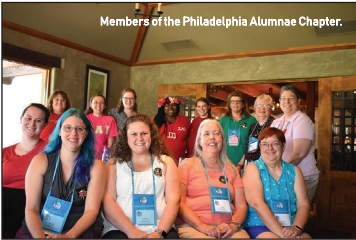
Members of the Philadelphia Alumnae Chapter.

plans for Chi A Province Day which we will be hosting in March. Sisters continue to participate in and support many local music organizations in the Delaware Valley.