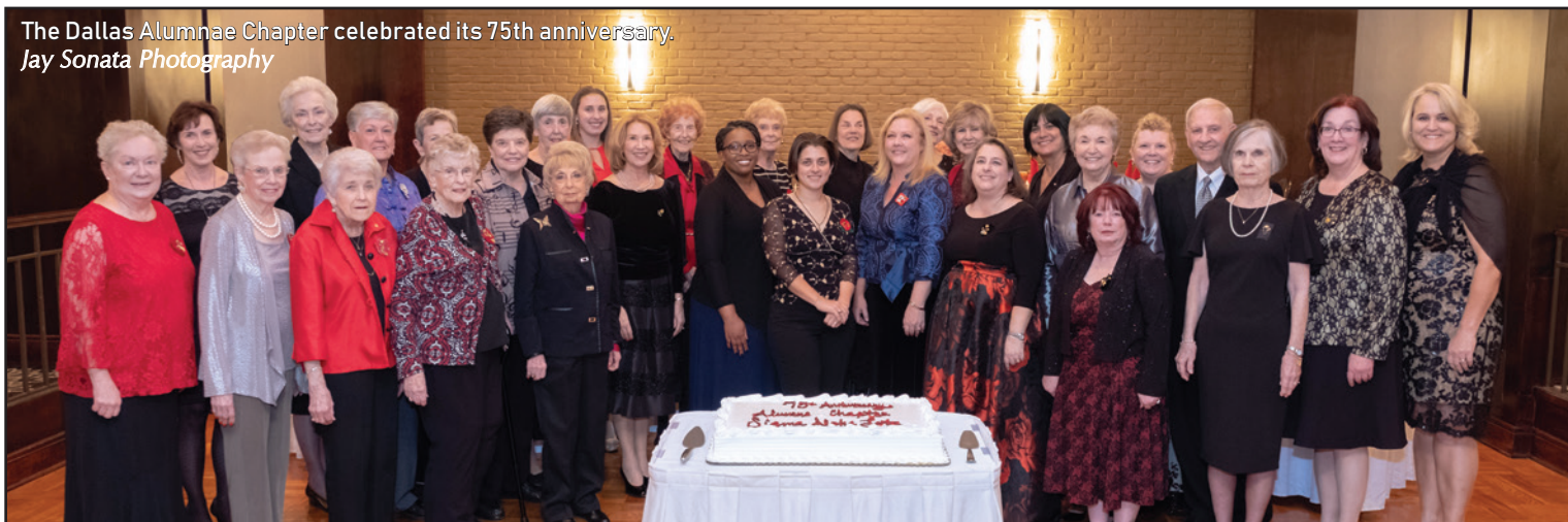
The Dallas Alumnae Chapter celebrated its 75th anniversary.