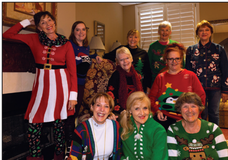
Members of the Hot Springs Alumnae Chapter in their "ugly Christmas sweaters."

HOT SPRINGS (AR) – In December, Cantate, a women’s vocal ensemble sponsored by the chapter, presented a series of performances to raise money for local musical organizations and to provide scholarship assistance. “Home for the Holidays” was the theme, featuring many familiar holiday songs, such as “Santa Claus is Comin’ to Town,” “Winter